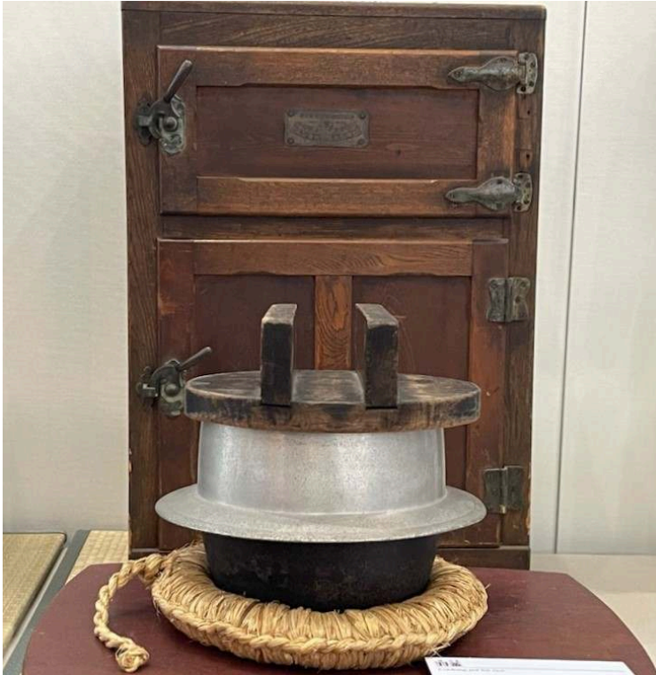
The kama is placed on a straw pot rest ; behind it is an old wooden refrigerator.