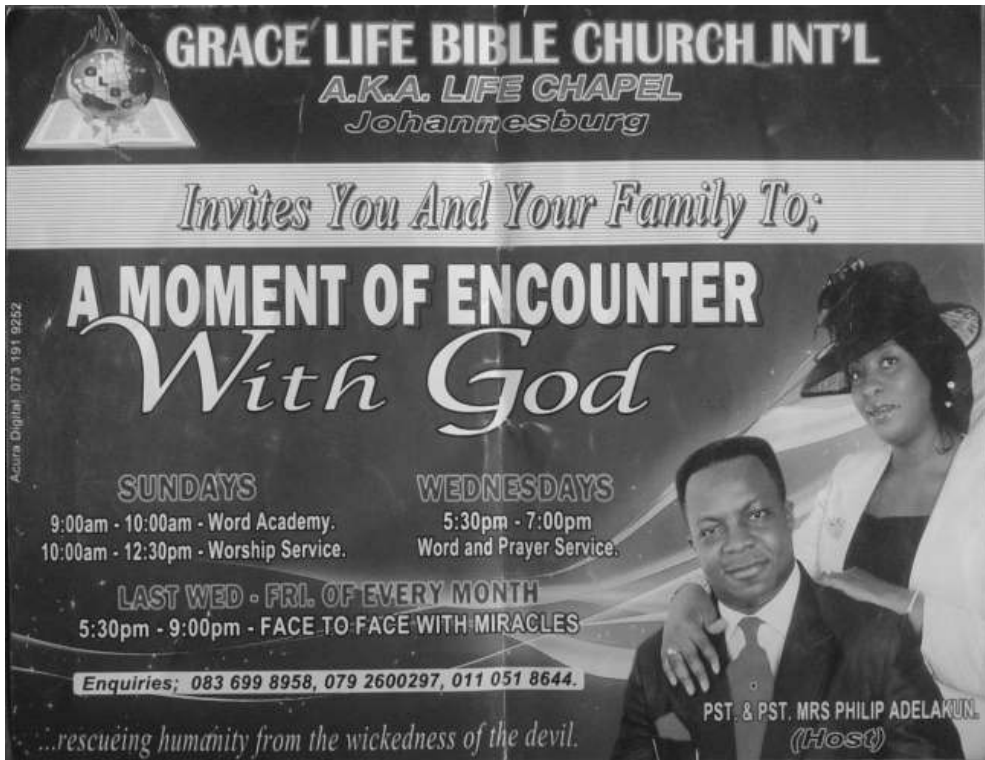
Figure 5 – Poster of an African migrant-initiated church photographed in a wall in Johannesburg, 2013.