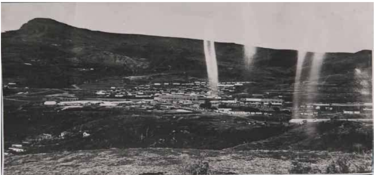
Figure 4. Old photograph of the Pico do Cauê in 1932, before mineral extraction.

place an emphasis on the practical and statistical gains that the task contributes to the research.