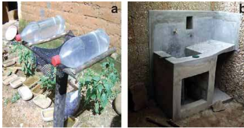
Figure 2. Solar disinfection and study kitchen sinks. a: Solar disinfection of drinking water and kitchen cloths; b: Study-built kitchen sink.

Testing tools and hardware included local mud pots, timers, two spring scales with a 20kg range (precision \pm 0.1 kg) to measure remaining unburned wood, charcoal and ashes.