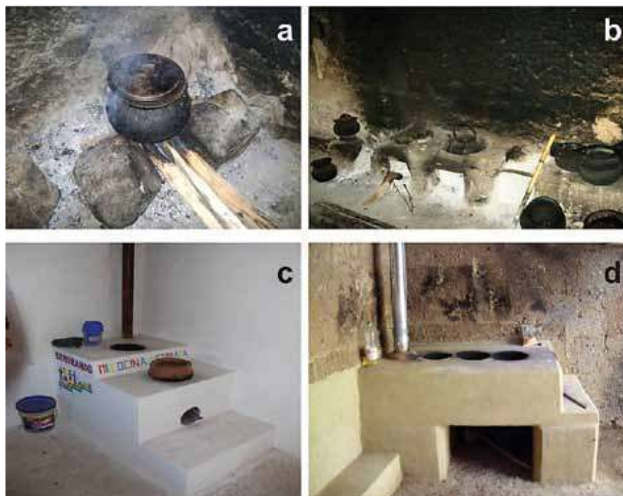
Figure 1. Type of stoves found in the Province of San Marcos and the OPTIMA-II improved chimney stove model. a: Open fire “Tulpia”; b: “Traditional” stove; c: government design “SEMBRANDO” stove; d: OPTIMA-II stove.