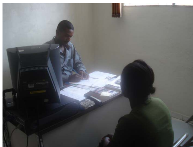
Figure 1. Access to a “GHESKIO loan” remains entirely confidential following ACME’s normal procedures.

Those meeting the preliminary criteria are referred to ACME who regularly organise a training course for groups of some twenty candidates. The two-day course aims to teach basic business management principles and to explain the commitments ensuing from the microcredit procedure. At the end of the course, a one-to-one meeting is arranged to prepare the microcredit application file. At this point, some participants decide not to take out a loan (1–3 per training session).