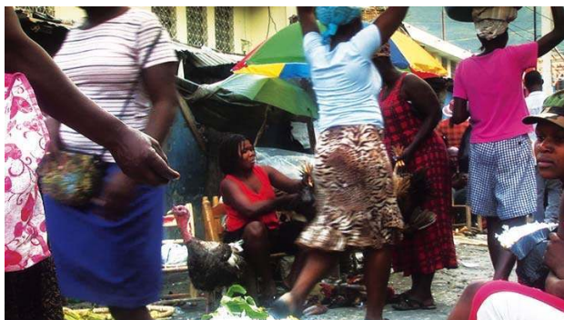
Figure 2. Street scene – most of Haiti's economic activity is in the informal sector.