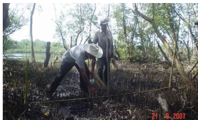
Figure 13. Rehabilitation of “ditches”

Rehabilitation of natural ponds or “ditches” : this activity is designed to rehabilitate natural water channels known locally as “ditches”, which are partly or totally blocked by accumulated sediments. The entry of these channels into the area is the main cause of the death of the mangroves due to the hypersalinisation and pyritisation of the water and soil. The poor circulation of the water gives rise to the stagnation of surface run-off water, which tends to disappear during the dry season, leading to the concentration of large quantities of mineral salts in the area. To reverse this effect, works are designed to open up natural “ditches” in order to recover the correct flow of tidal waters and prevent water stagnation. To execute such work, the former water “veins” are identified and the sediments are removed and retained at both sides of the channel through the construction of barriers (palisades) with dead vegetable matter (branches and logs, see Figure 13 and 14).