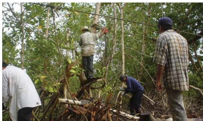
Figure 12. Procedure for rehabilitating natural ponds and water channels

Rehabilitation of water flows in natural channels and ponds (water medium) : this activity does not include the building of structures in the area. Its execution is aimed at restoring the natural dynamics of the water column (flows and reflows). No major machinery is used in designing and executing the work, but tools with a low impact, such as large knives, pulleys and ropes. The strategy consists of mechanically removing submerged wood from natural ponds and water channels. To that end, the local inhabitants are divided up into work brigades, with the mission of identifying areas of the channels that are partially blocked, and one of the brigades explores the water medium in order to identify the logs and branches that must be removed. That waste is moored and lifted using pulleys with a capacity of one ton and a half (Figure 12).