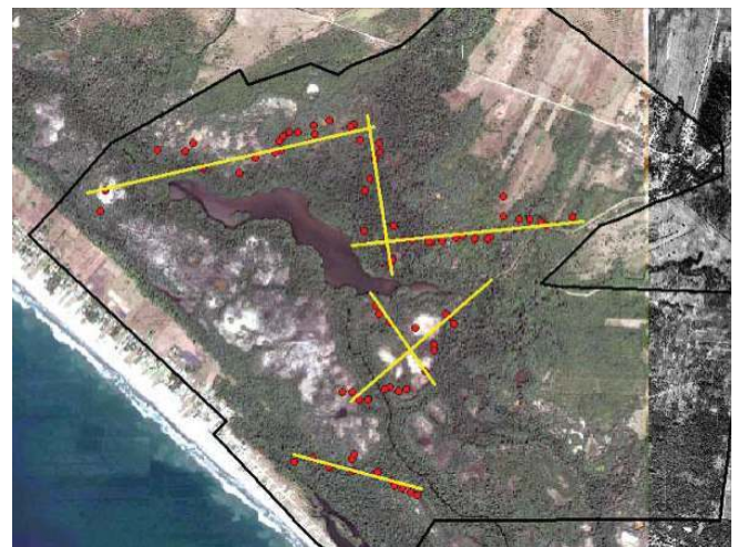
Figures 1a and 1b. Transects for mangrove linkages mapping