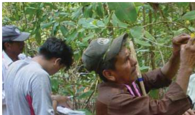
Figure 10. Obtaining of data in the permanent sampling units