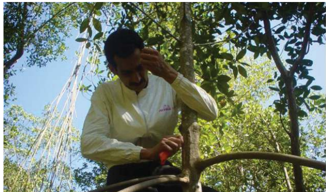
Figure 11. Marking the trees in order to verify their development rate

In each 30X30 metre plot, all the trees with a DPH of more than 7.8 cm were measured and marked. Only in the case of the Rhizophora mangle species was this measurement taken 30cm from the last root of the trunk. In the 5X5 plots, trees thinner than 7.8 cm but taller than 1.5 m were measured for R. mangle and trees higher than 1.3 m for L. racemosa and A. germinans . Lastly, in the 1X1 metre units, measurements were taken of all trees under 1.5 m but taller than 50 cm for R. mangle and trees taller than 30 cm for L. racemosa and A. germinans .