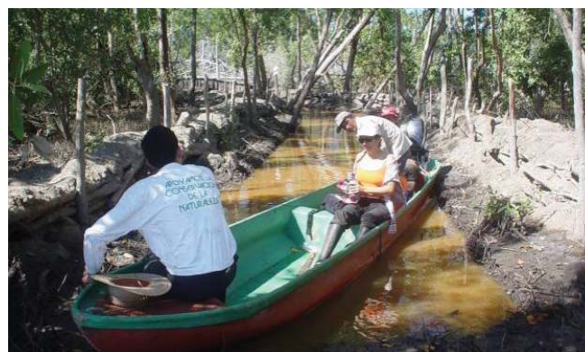
Figure 14. Example of the rehabilitation of a “ditch”, with the work completed

Then these barriers are consolidated by reforestation to prevent them from being damaged by the effects of the tide. The orientation and dimensions of each natural channel are