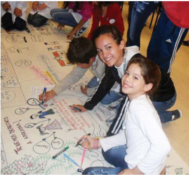
Figure 5. Provincial Fair project closure

It seems apposite to conclude the discussion by quoting F. Barreiro 7 : “Community learning actions are social interactions that create social capital. This is why projects put into action cooperatively generate and accumulate learning processes, in addition to their specific results. The signs of this learning are the results of projects carried out jointly, through social interaction”.