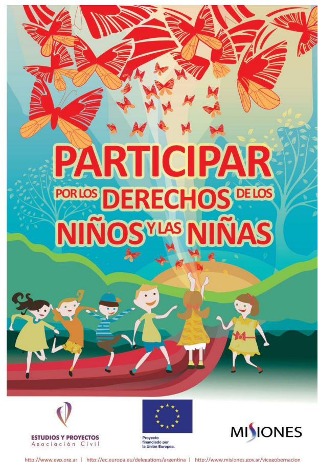
Figure 2. Banner of the project Participar

Towns on the so-called “Triple Frontier”, essentially the cities of Foz de Iguazú (Brazil), Ciudad del Este (Paraguay) and Puerto Iguazú (Argentina) have become the backdrop to frequent violations of the rights of children and adolescents. In particular, child domestic labour, child trafficking (transporting children within the country or overseas in order to exploit them) and child prostitution are three closely related issues. Journalists and local social organisations often find themselves in an uneven battle against criminal networks that profit from these crimes, and that usually act in collusion with levels of authority and even partly with the complicity of society itself. Failings in the control of border crossings, a lack of specific public policies, poverty and complicity have meant that, for a long time, the area has been conducive to this type of crime.