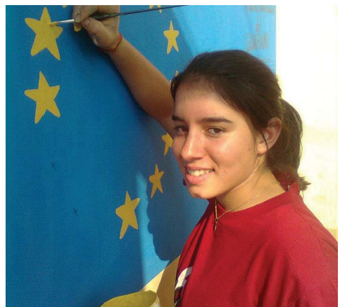
Figure 4. Mural Guarani (Misiones)

Monitoring and assessing the project took place under direct supervision with visits to each area, continuous remote monitoring, interim and final assessment workshops, meetings with provincial civil servants, the monthly and final application of assessment tools by participants and 34 local leaders, an analysis of the information gathered by the whole project team, and the production of photographic and video records.