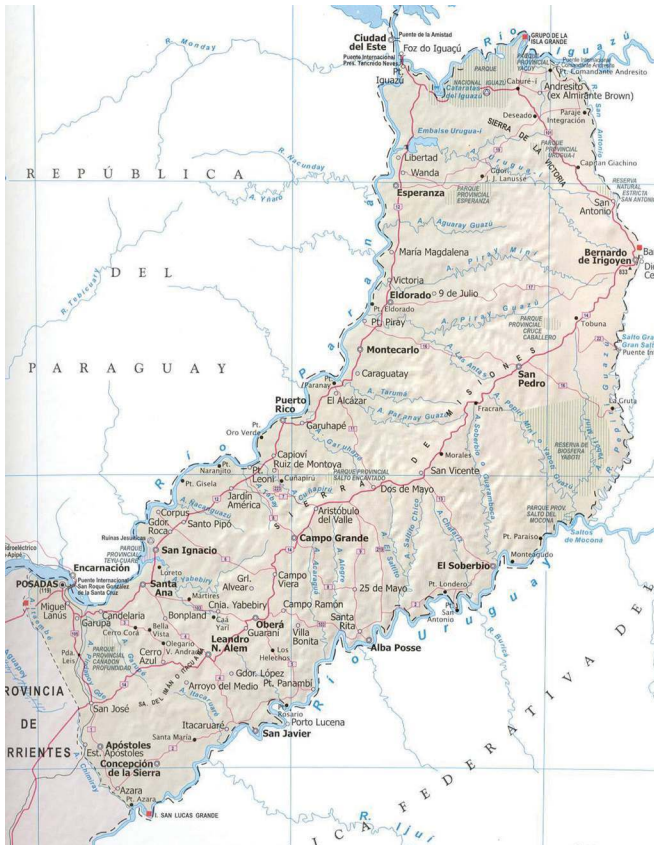
Figure 3. Map of Misiones Province

governments in this matter. Second, it aimed to strengthen the role of CSOs and their capacity to disseminate information about children's rights, monitor and assess public policy related to this issue, and generate ways for children to participate at a community level, with collaboration between children and those adults who play an important role in the defence of their rights.