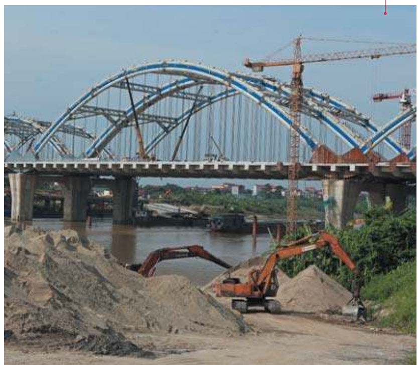
HANOI, VIETNAM - SEP 7, 2014: An under-construction bridge connecting the two parts of Red river in Hanoi capital.

Another issue is land for cultivation in the resettlement area. For Song Bung 4, each household has 1.5ha as stated in the approved plan, but people claimed that this was not enough. Beyond resettlement, social impacts included claims of problem with illegal workers from China working for the project (Nguyễn Thành 2013) and allegations that corrupt local officers lied about the amount of property loss to steal compensation money (Văn Nguyễn 2014).