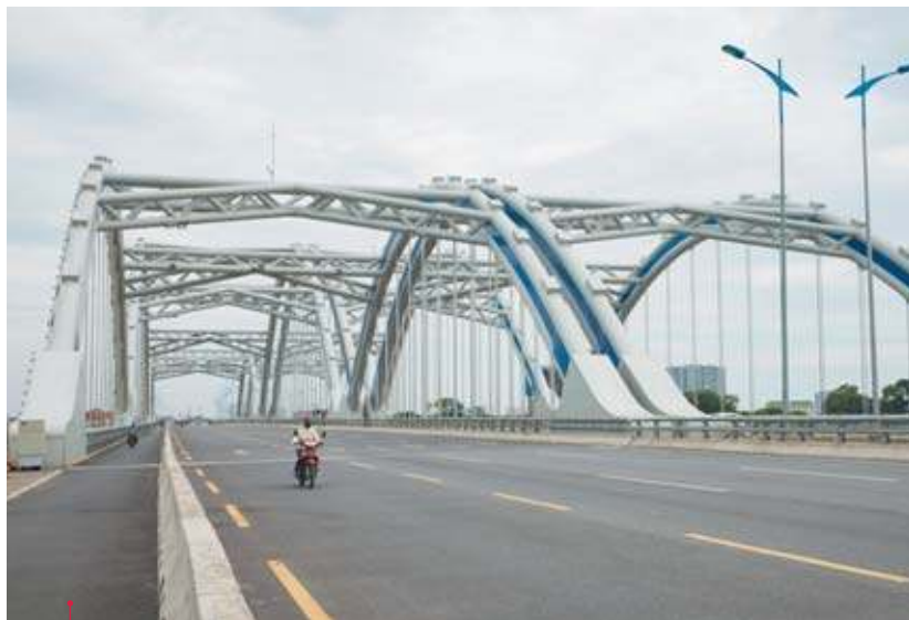
Hanoi, Vietnam - Aug 30, 2015; The Dong Tru arch bridge, made of steel tubes filled with cement, was opened for safety testing in Hanoi on October 2014 as part of the extended Highway No. 5 project. Hanoi / Shutterstock.com