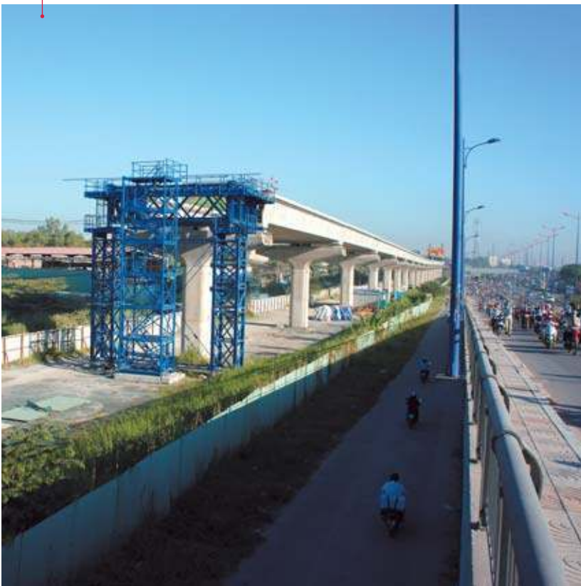
HO CHI MINH CITY, VIETNAM - Group of Asian construction worker work on overhead crane at metro project, an overhead railway for urban traffic development, Saigon, Vietnam, Nov 17, 2015.

Finally, the time period for the consultation process is only 15 days. After that period, if there has been no written response from the stakeholders to the project owner, then it is considered that there is no opposition to the project plans. Such a short amount of time is insufficient for conducting a thorough consultation process.