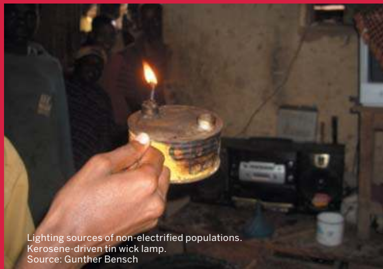
Lighting sources of non-electrified populations. Kerosene-driven tin wick lamp.

Head of "Climate Change in Developing Countries" group, RWI