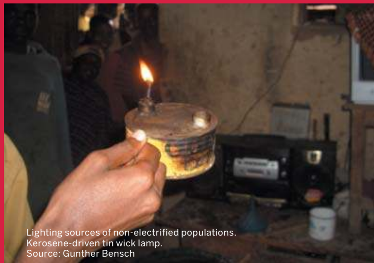
Lighting sources of non-electrified populations. Kerosene-driven tin wick lamp.

Head of "Climate Change in Developing Countries" group, RWI