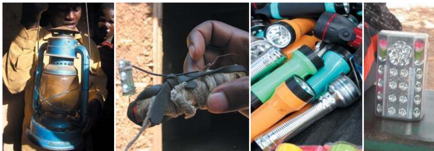
Kerosene-driven hurricane lantern