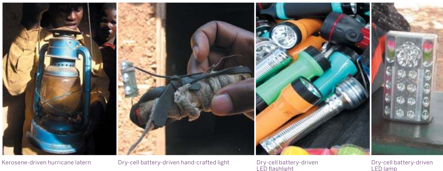
Kerosene-driven hurricane lantern