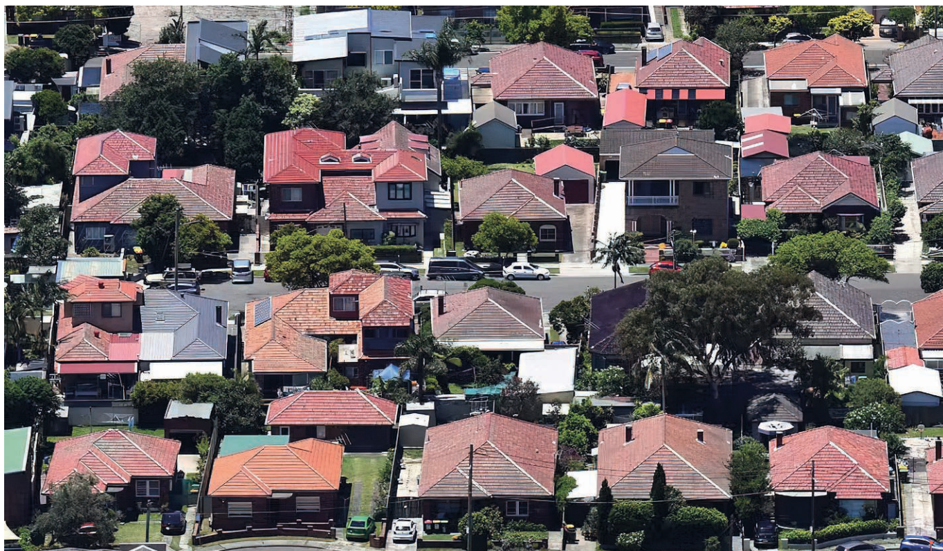
Aerial view of Sydney suburb. Residents are asked to paint roofs white and plant a tree in each garden to fight climate warming.

Over the last decade, an increasing focus has been put on the importance of human behaviours to achieve the green transition. Consequently, more and more behavioural experimentations aim at addressing sustainability issues. How do you account for this increasing popularity of behavioural sciences and the role they can play to accelerate the green transition?