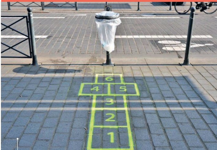
Example of nudge to encourage people to throw their waste (Lille, France).

Director and co-founder, BehaviourWorks Australia (BWA)