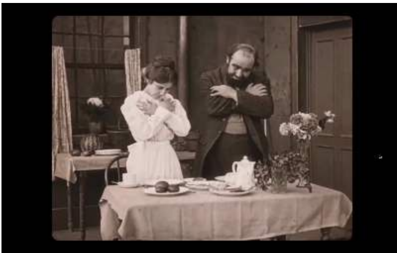
The relation between the two spouses, as well as their appearance, evolves with the integration of American norms ( Making an American Citizen , Alice Guy, 1912)