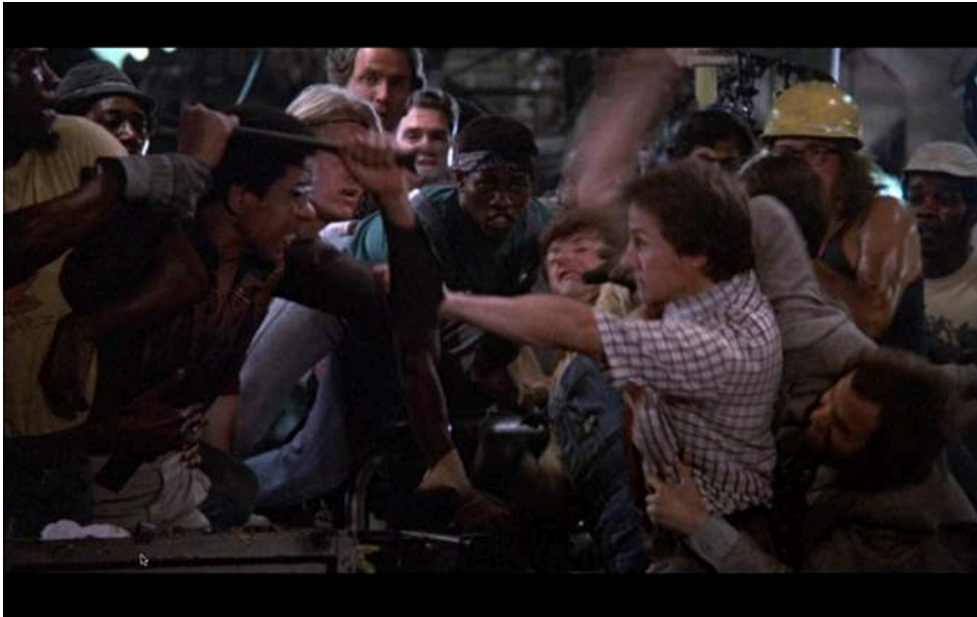
Jerry Bartowski (Harvey Keitel) and Zeke Brown (Richard Pryor) in Blue Collar : from friends to antagonists.