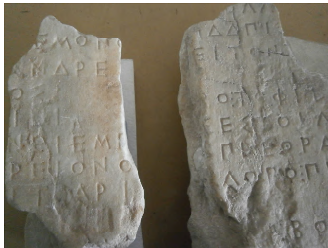
Fig. 4 = IG I 3 219 and 420 side by side.