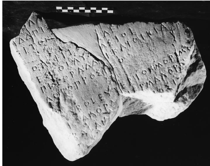
Fig. 3 = IG I 3 420 . EM 6659.