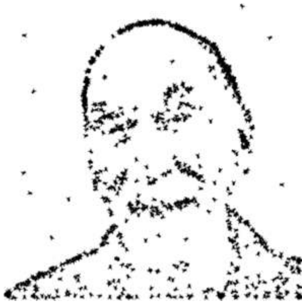
Portrait on the Fly (Frieder Nake)