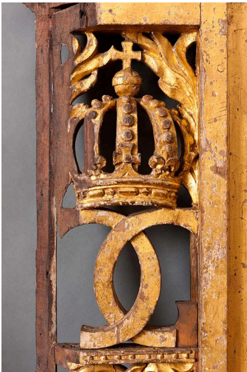
MODIFICATIONS TO THE CIPHERS ON THE BED RAIL, PROBABLY MADE FOR USE BY KING GEORGE I c 1715-1725.