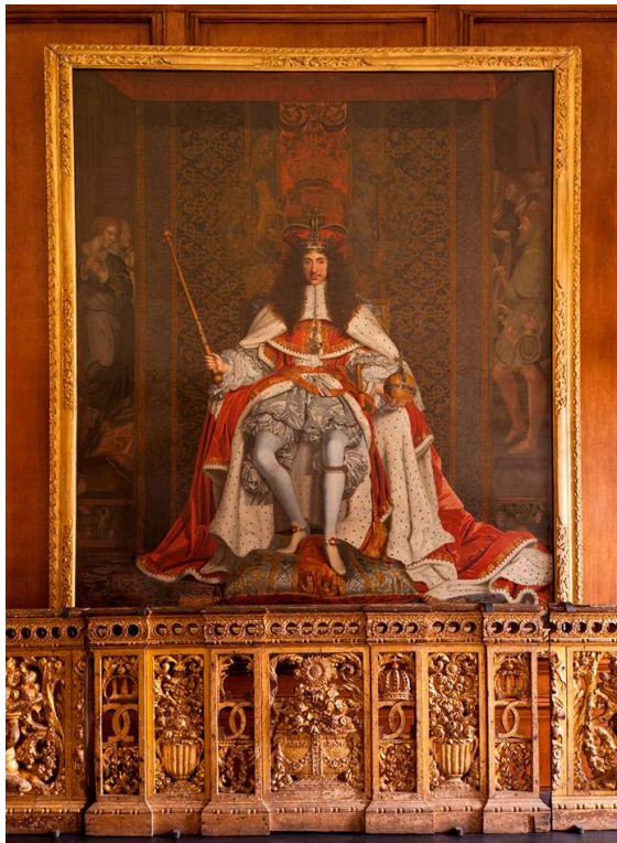
The bed rail when first shown in the Royal Bedchamber Exhibition, Hampton Court Palace, 2013.