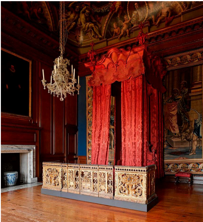
The Queen's Bedchamber at Hampton Court, created in 1715, with parts of the royal bed rail displayed.