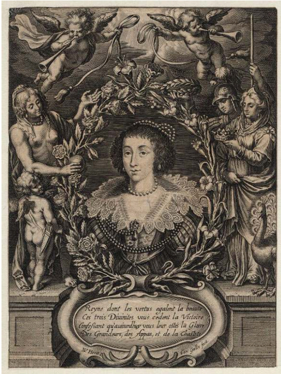
Henrietta Maria, engraving by Cornelis Galle the Younger, after Nicolaus van der Horst, engraving, 1625-1635. This contemporary print of the Queen prominently features a putto, roses and lilies like the bed rail.