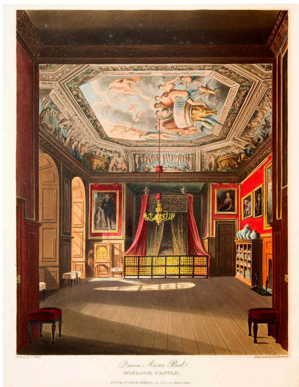
THE KING'S EATING ROOM AT WINDSOR CASTLE, ENGRAVED BY THOMAS SUTHERLAND AFTER CHARLES WILD, c1819, WITH QUEEN ANNE'S VELVET BED, 1714, BEHIND WHAT SEEMS TO BE AN EARLIER WIRE BED SCREEN.