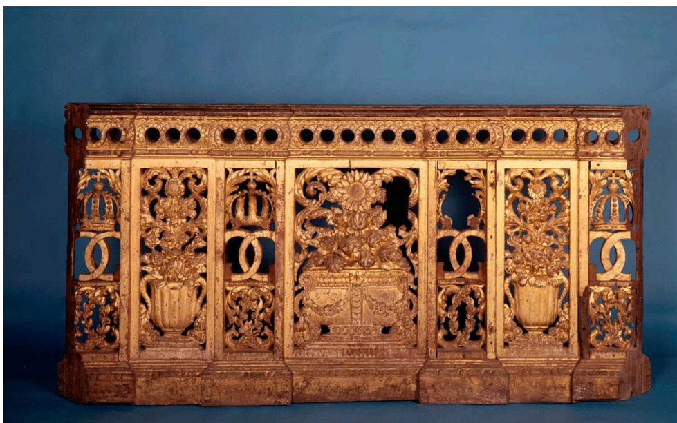
Alternate section of the bed rail with vases of flowers.