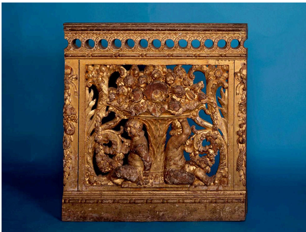
A section of the bed rail, carved with putti and tazze of fruit and flowers. English, gilded oak, c 1640.