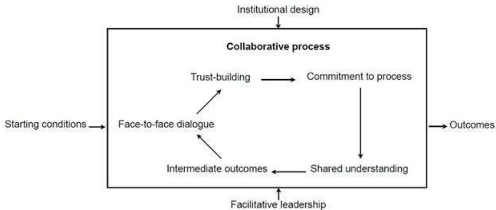
Figure 1. A general model of collaborative governance

Simplified from Ansell and Gash (2007, p. 550)