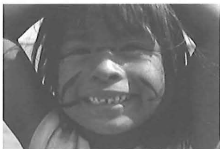
A gesture signifying embarrassment among the Wasusu (above, 1987), the Sararé (bottom left, 2007. Nambikwara, Guaporé Valley), and among the Wakalitesu, 2007