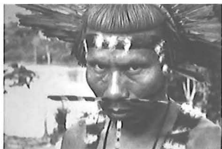
Lévi-Strauss' Bororo informant who met the Pope (Lévi-Strauss 1936)

Some of the bolder statements Lévi-Strauss did make in relation to photography – like his suggestion that about the Caduveo women's facial drawings he photographed express an ambivalence between hierarchical and egalitarian structures inherent to this society –, are based on his field observations of how nobles and commoners, warriors and vassals, men and women, are related in a society historically fraught by social differences. But Lévi-Strauss' own argument points to the relativity of this cultural feature, since the Caduveo sought dissimilar means of expressing themselves: the abstract women's drawings tellingly revealed this intrinsic tension of their lives, whereas the figurative sculptures and drawings were not directly related to such tensions. The efflorescence in Caduveo women's mouths, in this sense, is an expression of an unresolved contradiction, acting as a kind of deep structure inhabiting the lives and minds of certain individuals in Caduveo society. As Lévi-Strauss himself states: this contradiction continued to trouble the Caduveo in an insidious fashion, and because they paid no heed to it on a conscious level, they began to dream about it 1 .