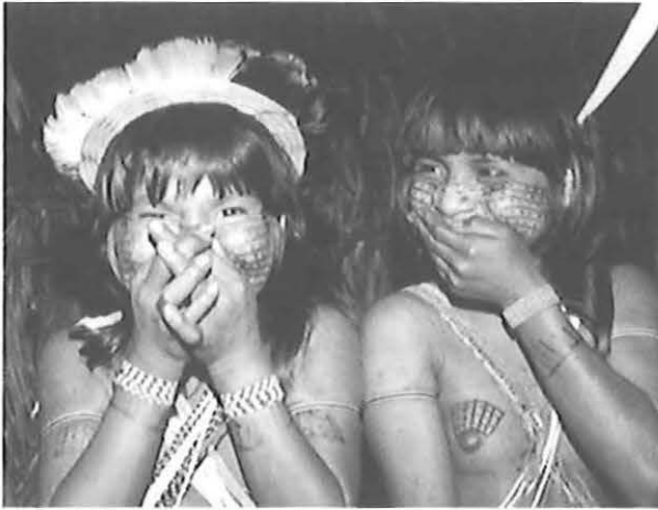
Camera conscious Mamaindê girls, 1992

Many Nambikwara groups had no significant pictorial tradition at the time of Claude Lévi-Strauss' fieldwork, and when I arrived in 1986 among the Wasusu, a rather isolated Nambikwara-speaking group, many people still did not know how to look at photographs (they held them upside down and had to make an effort to perceive the images in them before correcting their mistake). Obviously, once they learned the operation, they mocked those among them who had a difficult time looking at pictures, as it is still the case with some older people who never grew accustomed to them. Nowadays, the situation has changed completely, and one of the main expressions of the archival use of photographs is the very group Lévi-Strauss studied in greater depth: the Wakalitesu.