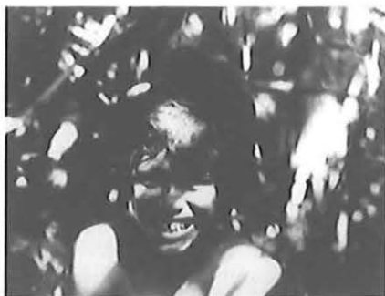
Scene of Nambikwara daily life in 1938 (above left,) and photos of the Wasusu (Nambikwara of the Guaporé) in 1987 (above right and bottom,)

My own photographs of the Nambikwara often reveal similar traces of this embodied continuity, even though they were taken over 50 to almost 70 years