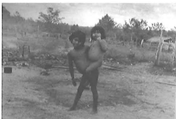
A sibling's participation in child care (Lévi-Strauss 1938)

from his photographs, should be considered in light of his interest in describing Nambikwara body techniques or corporeal style. Indeed, some of Lévi-Strauss' photographs make it quite clear that he was not trying to conceal anything at all.