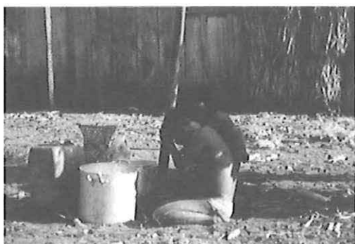
Méditations, Wasusu women day-dreaming, during a fruit gathering foray (left) and at work in the village (right), 1987

Lévi-Strauss' photographic accomplishment was to have managed to catch the young Nambikwara women and men in such postures, although, in this case, he definitely benefited from the fact that the Nambikwara, as he has said, did not yet understand photography, and thus did not pay any attention to his taking pictures of them. Indeed, some of the scenes that Lévi-Strauss managed to photograph at the time of his fieldwork among the Nambikwara are quite rare nowadays. It is difficult today to catch someone in a daydream, and even more difficult to surprise people in demonstrative outbursts, like the ones in which Lévi-Strauss shows the Nambikwara's embracing, engaged in the practice he defines as « fake love-making » both in hetero- and « homosexual » relations. Such « fake love-making » is difficult to observe today not only because of the historical presence of missionaries in the area, but also because the Nambikwara today are quite aware of photography, and some groups are quite reserved about its use 3 .