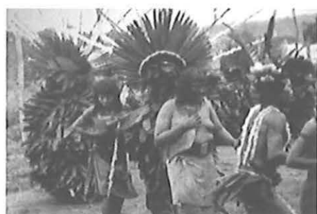
Scenes of a Bororo funeral (Lévi-Strauss 1936)

Perhaps we can say something similar about Lévi-Strauss' Bororo photographs, which give special attention to the funeral dances, to ritual performance