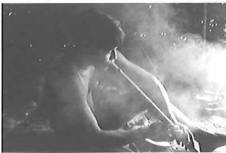
Making flutes among the Wasusu in 1987 and playing them among the Sararé, 2007