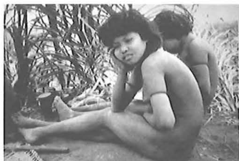
La rêveuse (Lévi-Strauss 1938)

But let us now return to Lévi-Strauss' photographs and what they can tell us about Nambikwara culture. Beyond an anthology of their body techniques and testimony of their persistence through time, what should most raise our interest in them is the message they convey. Consider for instance a photo such as that of the day-dreamer ( La Rêveuse ): a young woman from the group who, from her sitting position on the ground, and leaning her head on her arm, seems lost in thoughtful reverie. She seems to be an embodiment of the nostalgia that Lévi-Strauss encountered in the tropics.