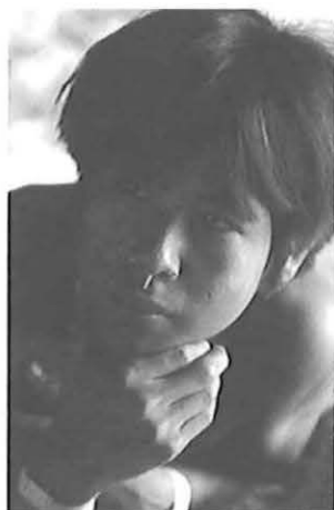
Le penseur (Lévi-Strauss 1938) and Sararé youth after piercing, 2007