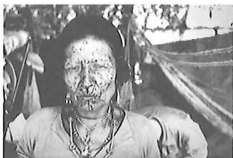
Caduveo facial drawings (Lévi-Strauss 1936)