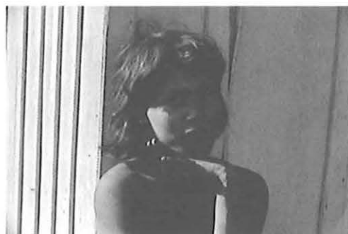
La rêveuse Wasusu, 1987