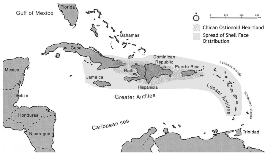
FIG. 1 – Map of the Late Ceramic Age Caribbean indicating the spread of shell faces and the Chican Ostionoid heartland.

array of face-depicting shell objects that have been found in the Caribbean as far north and west as Central Cuba and as far south and east as the tiny Île de Ronde in the Grenadines. The contexts of these shells can all be placed in the Late Ceramic Age (AD 600/800-1492) and have iconographic elements that in most cases resemble Chican Ostionoid iconography. The Chican Ostionoid series is connected with the Taíno cultural tradition (Figure 1). Although the use of the word Taíno and its association with specific cultural characteristics is commonplace in Caribbean archaeology it is not well known outside of Caribbean archaeology. In addition, the use of the term is not as unproblematic as it was once thought to be, which necessitates a short introduction of it.