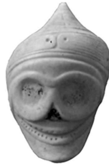
1 cm 1 cm