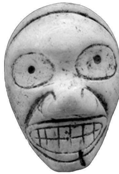
FIG. 11 – Guaíza from El Cabo, Dominican Republic, length approximately 4 cm.