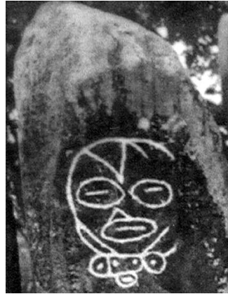
FIG. 6 – The Caguana cacique petroglyph.

( ibid. ) it could have been that the interplay of white shell with materials of other colours made the guaíza an aesthetically highly valued artefact in the Late Ceramic Age 12 . It has to be noted that decorations that adorned the shell guaíza probably echoed the adornments of the person that was supposed to wear it, making this configuration an actual copy of the wearer.