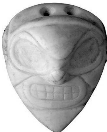
FIG. 7 – Guaíza from Potrero de El Mango, located at the Gabinete de Arqueología, Havana, Cuba (photograph by author).

in Taíno iconography, but more pointedly the navel was perceived as the mark that distinguished the living from the dead according to information by Pané (1999, p. 19). Consequently, the place of the guaíza on or near the navel in this way deftly harks back to what the guaíza actually is: a representation of the face of spirits of the living.