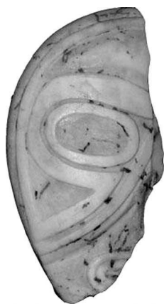
FIG. 10 – Guaíza with an unknown context, length approximately 7 cm, located at the Museo Indocubano Baní, Banes, Cuba.

Eighteen of the guaízas also have another interesting iconographic element that cannot be interpreted as personal adornments (Figure 10). This element in some cases consists of a single carved line or multiple carved lines running from the eyes to the lower cheeks, in the more elaborate examples they are actual bands rather than simple incisions. This specific element can be found on many more elaborately carved Taíno affiliated artefacts such as cohoba stands, wooden statues and carved stones, and also as part of petroglyphs. Arrom (1975) was the first to identify these patterns as « tears » running down the cheeks of these face depicting artefacts. Establishing the extent and importance of this iconographic element is a difficult task, since it is easy to misinterpret some of the articulated cheekbones, which are also carved on many of the faces, as these « tears ».