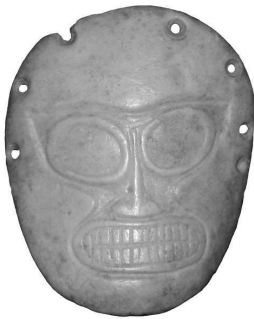
1 cm 1 cm

Shell faces are shell discs or cones with an anthropomorphic or zoo-anthropomorphic face depicted on them with archaeological contexts of roughly AD 1000 until early contact times 4 . These artefacts have been called differently in many publications, but all these refer to the same type of artefact 5 . For the analysis of the distribution of these guaízas a database has been put together that categorizes form and iconography (Mol 2007) 6 . The guaízas have a length that ranges between the 3 and 13 centimetres and a width that ranges between 3 and 7 centimetres with the average guaíza being around 8 centimetres long and 4 wide. The majority (50) of the guaízas have a face that is modelled on the lip or part of the body of the queen conch ( Strombus gigas . Figure 2). There are also a number of guaízas which are modelled on a milk conch ( Strombus costatus . Figure 3) or similar species. In these cases the guaíza is not modelled only en face, but in a more three-dimensional manner, more reminiscent of the actual form of a human face.