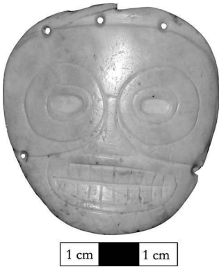
FIG. 5 – Guaíza from Potrero de El Mango, located at Museo Indocubano Baní, Banes, Cuba (photograph by the author).