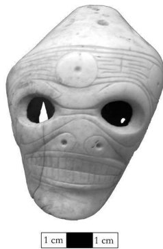
FIG. 9 – Guaïza with an unknown context, located at the Fundación García Arévalo, Santo Domingo, Republica Dominicana.