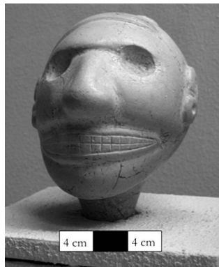
FIG. 4 – Stone cabeza from the Museo del Hombre Dominicano, Santo Domingo, Republica Dominicana.

chap. 59), in which he notes that: « [E]stas carátulas o figuras, llamadas guayças, la letra y luenga ». These valuable statements are supplementary. One describes guaizas as shell masks, while the other does not identify a material and adds figurines to the category of guaiza . It must be concluded from this that the phenomenon of guaiza must have had a material reflection as « masks » and figurines. In the case of the Late Ceramic Age Caribbean these are large categories of material culture, so the idea that artefacts can be depictions of « the spirit of the living » could be extended to faces and figurines of many different materials and possibly also other face-carrying artefacts from the Greater and Lesser Antilles (Figure 4).