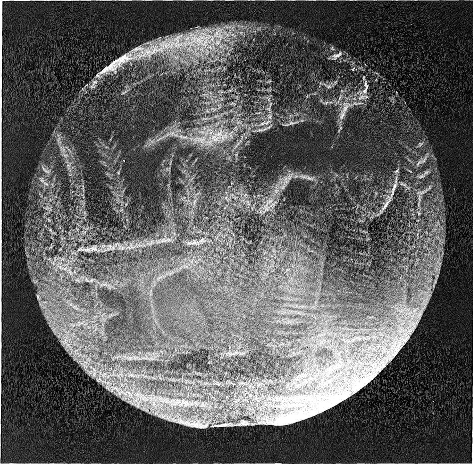
Fig. 3. Seal of rock crystal