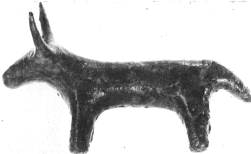
Fig. 4. Bronze bull figurine