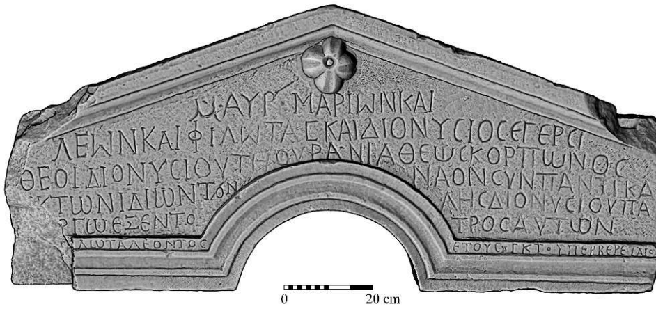
INSCRIPTION OF ASHKELON (INSCRIBED GABLE)