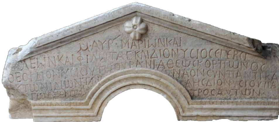
INSCRIPTION OF ASHKELON (INSCRIBED GABLE)