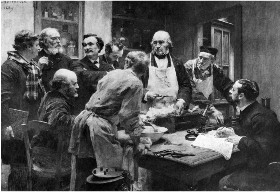
Léon Lhermitte, Claude Bernard's Lesson , 1889, ARR