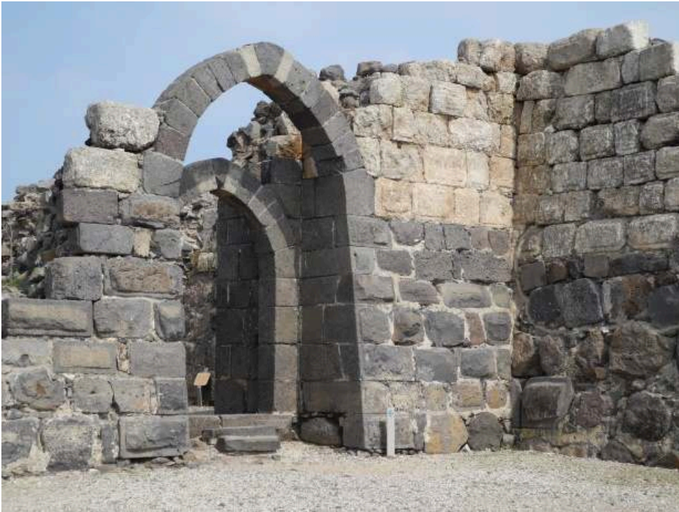
Fig. 7 – The west gate tower.