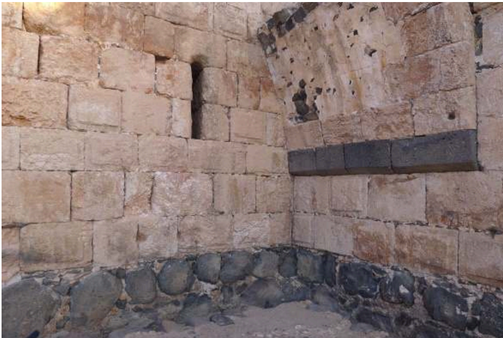
Fig. 6 – Vault inserted in the wall.

create a clearance in front of the chapel, a vaulted structure with very thick walls was attached to the southern vault., completing the condemnation of the western bay. The chapel most likely had a main door to the south, fronted by an open space suitable for the processional entry of the Hospitaller brothers during mass and daily services. This “forecourt” can also be found in the Hospitaller castles of Crac and Margat. However, the disposition of the chapel along an east-west axis was inconvenient, for it blocked north-south traffic on the upper floor. No doubt a second door had to be pierced to the north in order to provide a passage through the chapel or a new access from the north. The location of the chapel on the gate tower also raises the question of its defensive capabilities. It is possible that the chapel itself could have been defended by the opening of arrow-slits in the western bay of the nave. This hypothesis is corroborated by some elements of the lapidary that remain to be studied more closely.