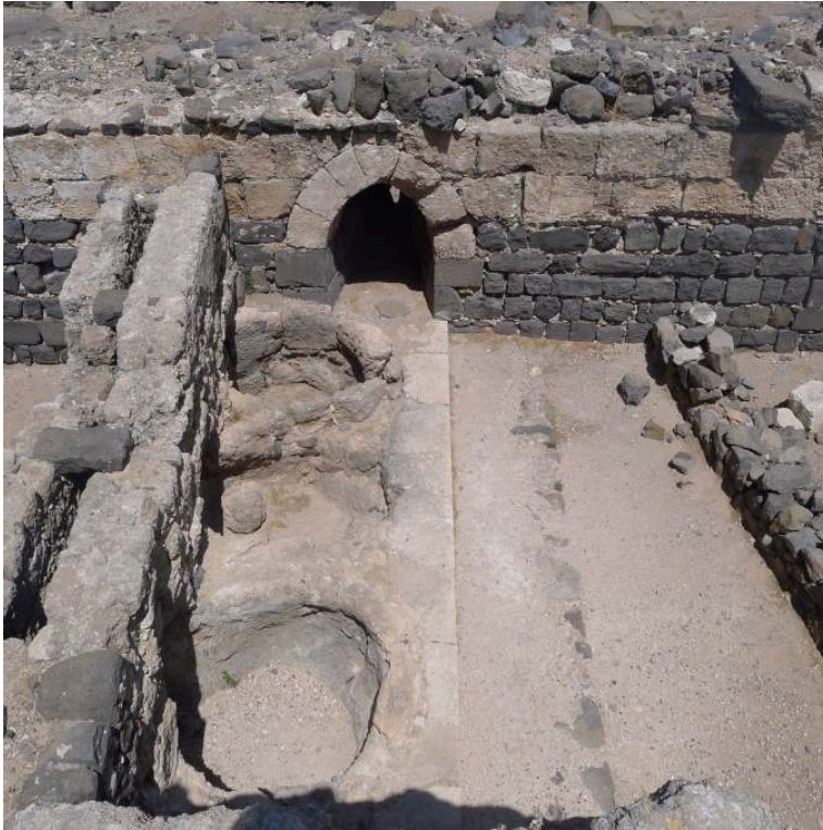
Fig. 8 – The three ovens.

whether the place did not become a kitchen or a sugar-production workshop because the construction of the ramp had partially blocked the monumental door 11 .