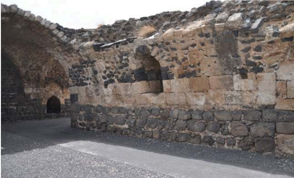
Fig. 3 – The endless hall, north gallery.