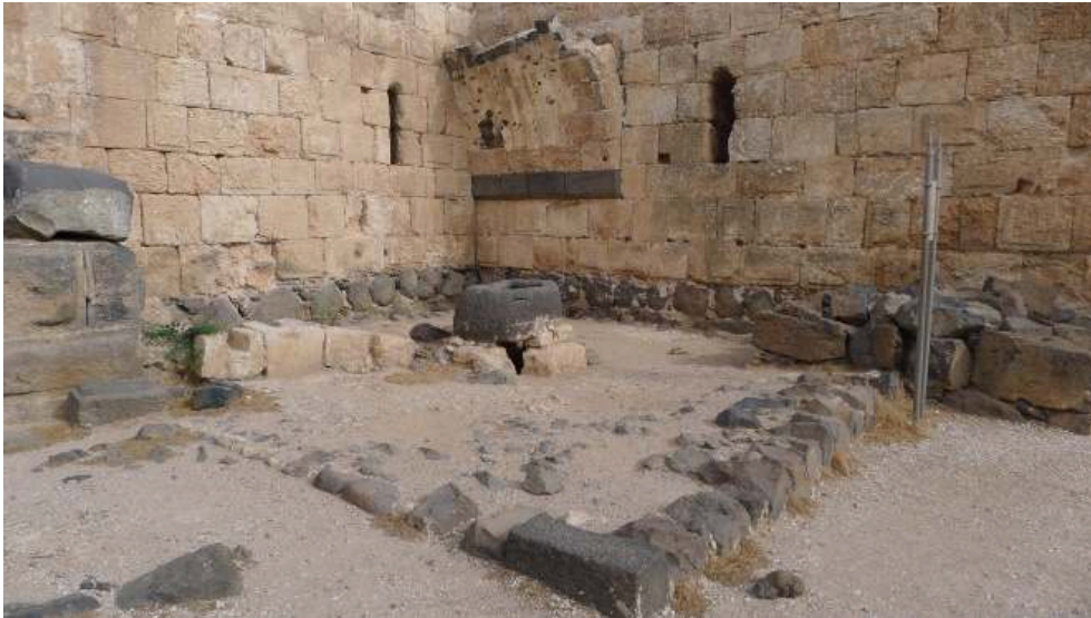
Fig. 9 – The small tank.

construction of the chapel's apse. This observation tends to confirm that the building-modifications linked to the installation of the upper floor had been indeed contemplated from the outset, but that they result from a series of changes carried out on the basis of a centripetal modular plan. The cistern was first excavated by Meir Ben Dov. He found most of the carved blocks that are now in the National Museum in Jerusalem. However, we still don't know when these blocks, which were not reused in Arab houses, were put aside and preserved from deterioration.