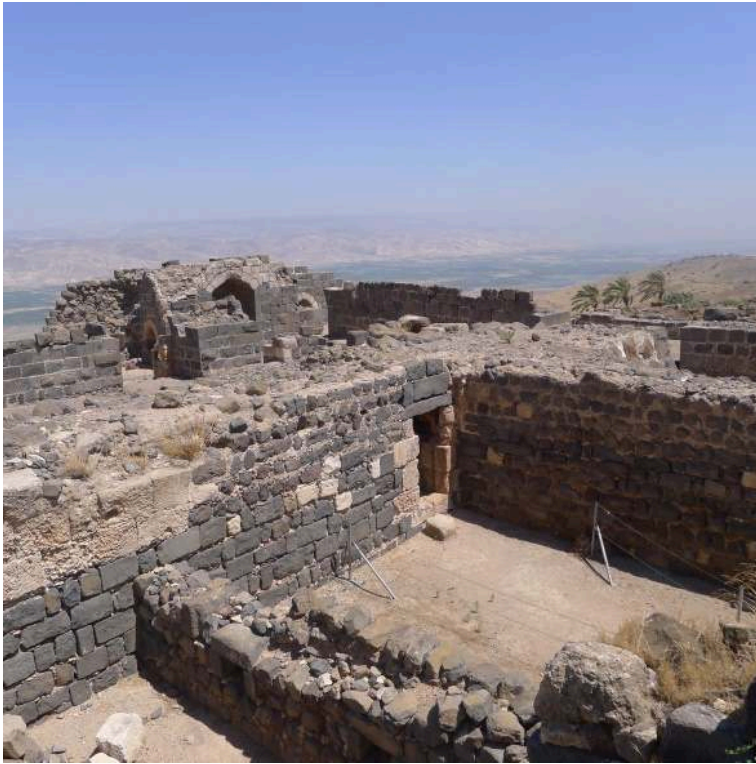
Fig. 1 – Eastern part of the castle.

The castle of Belvoir has two concentric enclosures ( Fig. 2 ) 2 . The first, with a square plan, is surrounded by four quadrangular towers and corresponds to the inner castle, which is articulated around a courtyard with a cistern; the endless hall along the curtain walls supports a floor that has now been completely destroyed. Access to the inner castle was from the west through a tower-gate with a side entry. There is a smaller door on the opposite side, to the east. The second enclosure is pentagonal and has seven towers. It surrounds the inner castle, protecting with its walls various service areas, among which a large cistern and ovens were identified. It is bordered on three sides by an imposing ditch dug in the basalt plateau. The stones from the digging provided the necessary material for the construction of the castle, particularly for the sloping banks of the two enclosures. Unlike the inner castle, the main access is to the east, on the side of the slope leading to the Jordan Valley. This access has undergone various modifications during the successive occupations of Belvoir. Below, the remains of a barbican preserved in the middle of a stone scree, testify to a forward defense.