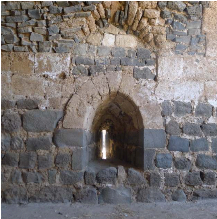
Fig. 4 – Archer in the vault.

Situated at the heart of the fortification, the courtyard is a space with many functions: enabling traffic between the rooms on the ground floor and access to the upper floor; it also houses one of the cisterns (Fig. 5).