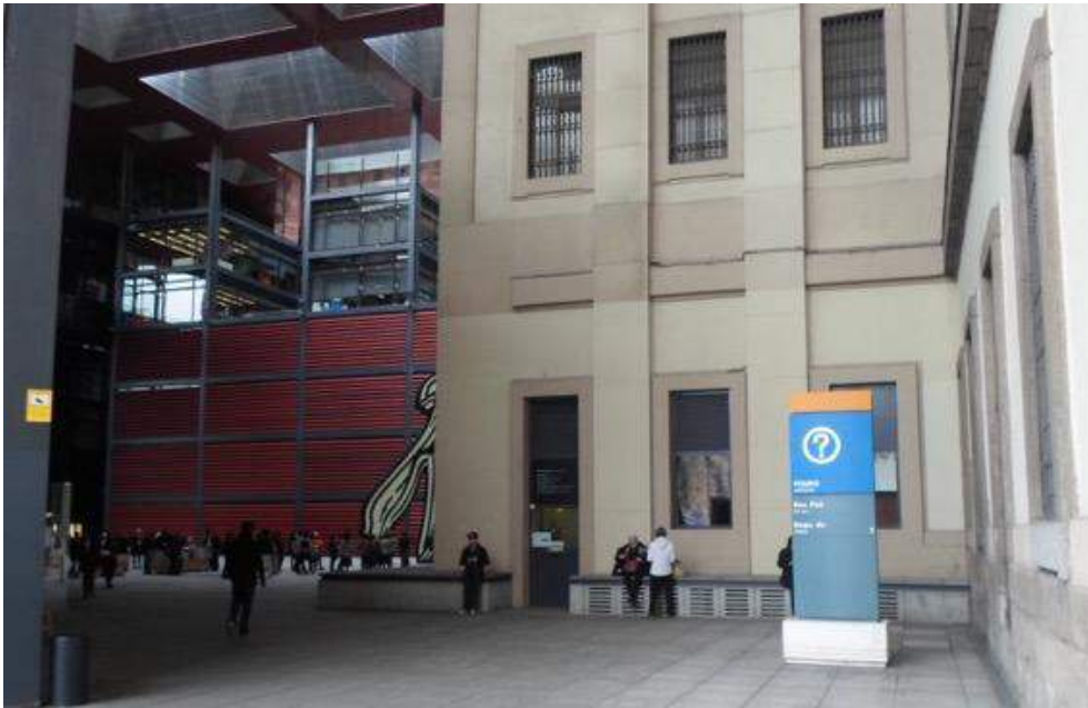
Fig. 3 – Madrid. Museo Nacional Centro de Arte Reina Sofía (MNCARS)

opportunity to air his reproaches to the Madrid City Council for not fulfilling its promise to bury adjacent traffic.