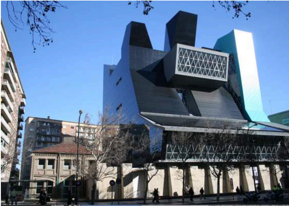
Fig. 4 – Zaragoza. IIACC Pablo Serrano