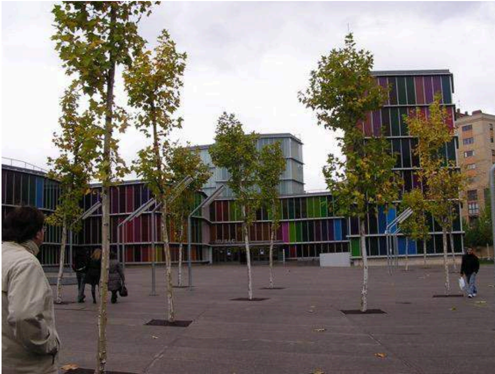
Fig. 5 – León. MUSAC – Museo de Arte Contemporáneo de Castilla y León