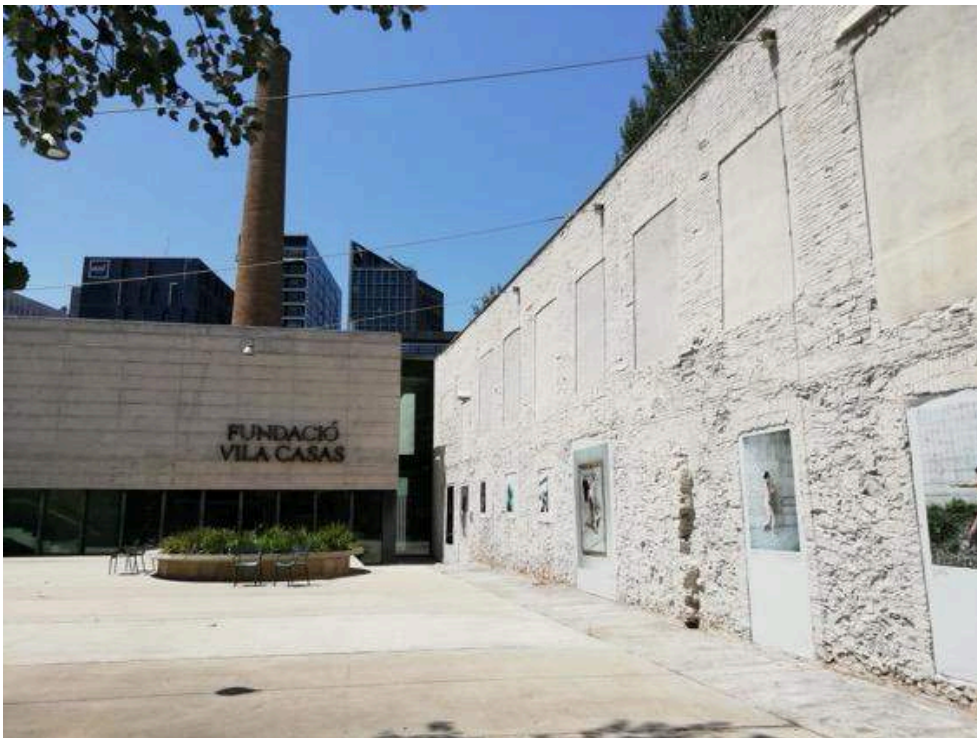
Fig. 2 – Barcelona. Fundació Vila Casas – Can Framis