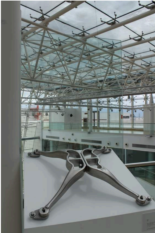
Fig. 6 – Agoncillo. Museo Würth, Agoncillo. Garra (staples anchoring the glass cover), exhibited in the museum as a sculptural work.