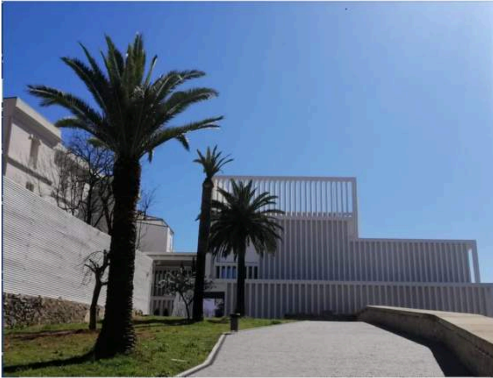
Fig. 10 – Cáceres. Museo de Arte Contemporáneo Helga de Alvear

conceived to look from the inside out, something that Tuñón had very much in mind among the traditional invariants of the Spanish architecture defined by Chueca Goitia (in Pérez and Pereda 2018, 40). It could also be compared to the brick cladding extension by Moneo for the Museo Nacional del Prado in the Jerónimos Cloister. Ultimately, the decision to use the museum's rooftop as a connecting thoroughfare between the historic city centre and the modern urban expansion is now an international trend following postmodern precedents, from the extension of the Staatsgalerie in Stuttgart to Bilbao's 'Guggy' (Lorente and Gómez 2023, 132-135).