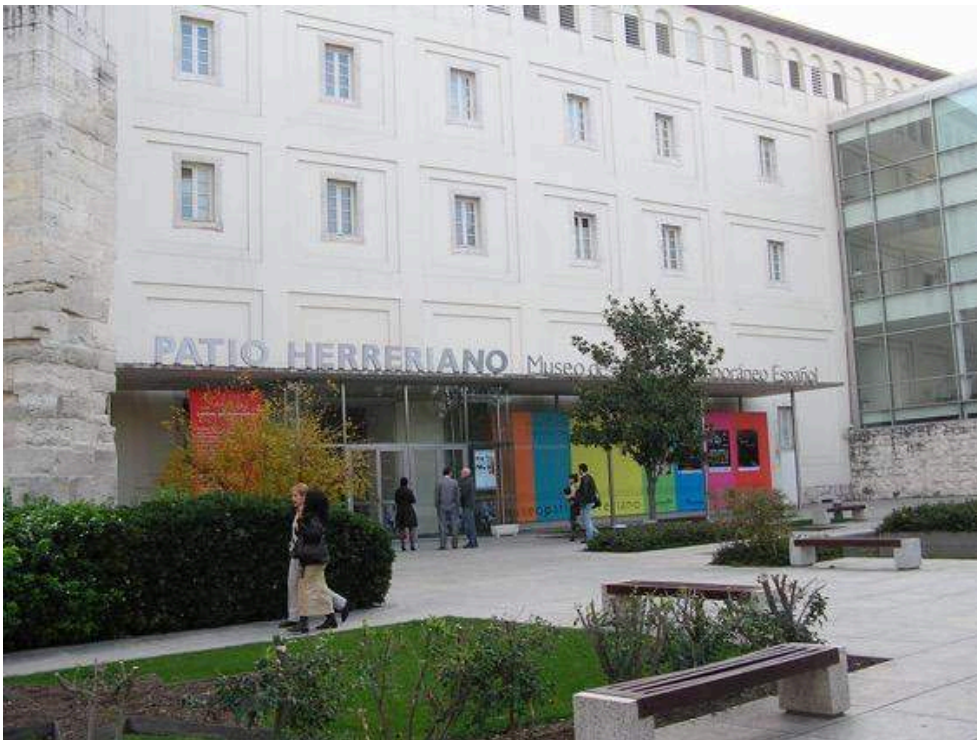
Fig. 1 – Valladolid. Museo Patio Herreriano