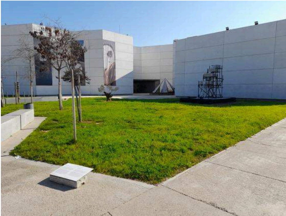
Fig. 8 – Córdoba. Centro de Creación Contemporánea de Andalucía (C3A)

new works in Córdoba, the Centro de Creación Contemporánea de Andalucía (C3A). As staunch neo-modernists, they dared to question the supposed effectiveness and flexibility of the neutral and universal white cube so as to claim a building closely linked with its emplacement and its Islamic past, which is evident in not only the geometric pattern of the façade, but also in the character of an ‘art factory’, with workshops connected to the exhibition halls like a souk designed for the confluence of audiences and functions (Nieto Sobejano Arquitectos 2023, 16) (fig. 8). Another detail that reinforces local identity links is the presence in front of the main entrance of an olive tree planted by conceptual artist Yoko Ono, which is growing with no need of the meticulous care required by her previously commissioned olive tree at the Guggenheim Bilbao.