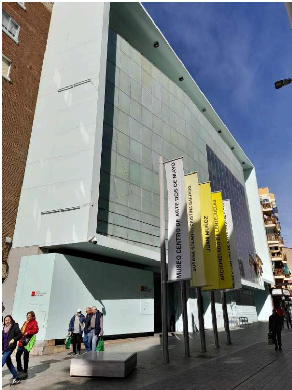
Fig. 7 – Móstoles. Centro de Arte Dos de Mayo (Museo CA2M)