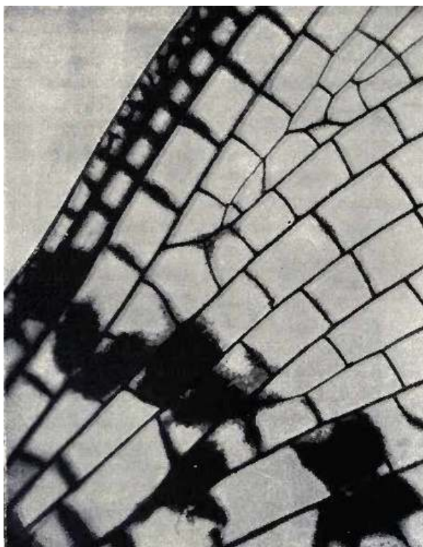
Fig. 2 – Photomicrograph showing a portion of the wing of a May-fly. C. 1904. John Ward. From Minute marvels of nature : being some revelations of the microscope exhibited by photo-micrographs taken by the author.