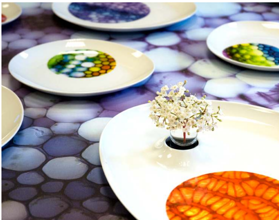
Fig. 5 – Plates from “Jardim Porcelânico” for Vista Alegre Atlantis, 2011