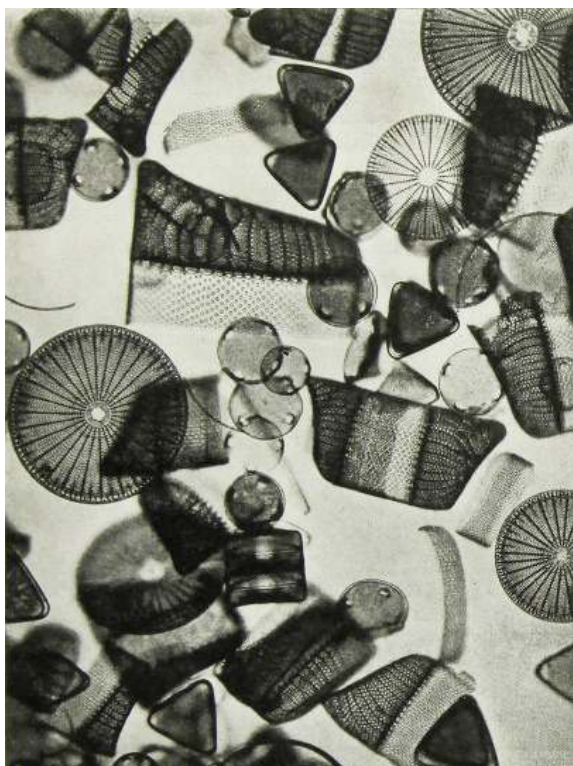
Fig. 3 – DEEP SEA MUD, c. 1933, AUGUST KREYENKAMP