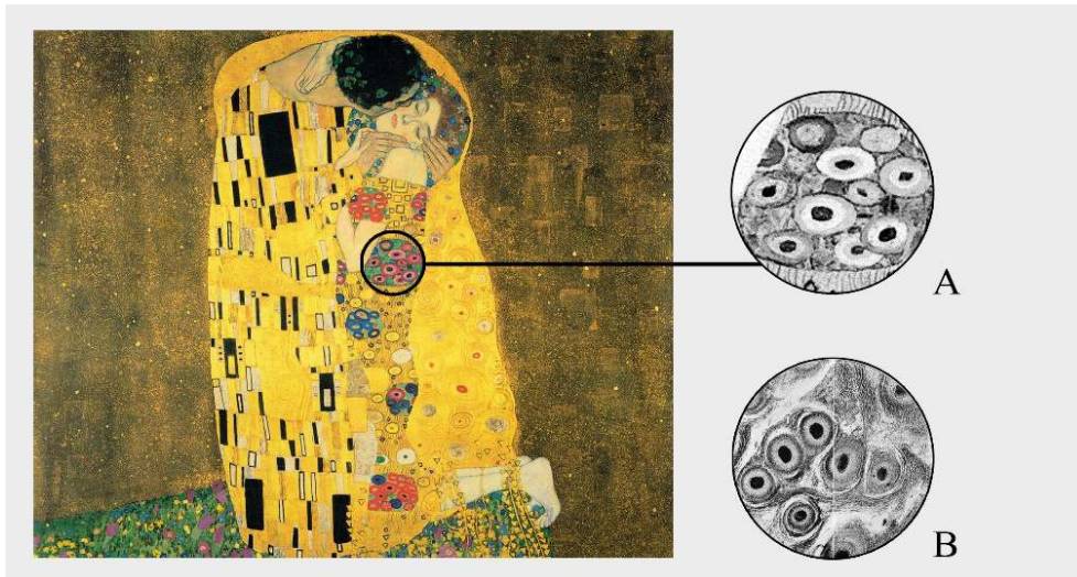
Fig. 1 – The Kiss, 1907, Gustav Klimt. Austrian Gallery Belvedere. These particular shapes (A) resemble photomicrographs of human tissue as shown in the Handbook of Photomicrography , published in 1913 (B).

these are recurrent in his graphic vocabulary. Klimt's work is an interesting example of the connection between photomicrography and art. Yet, a major question still arises pertaining to this subject. Was photomicrography an art itself? To address this matter we briefly recall the long-lasting discussion on whether photography is or is not considered art.