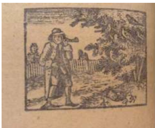
Woodcut illustration from A Supplement to the History of Robinson Crusoe showing designs similar to those by Thomas Bewick. British Library. Shelf mark 1459.a.19.(1.)