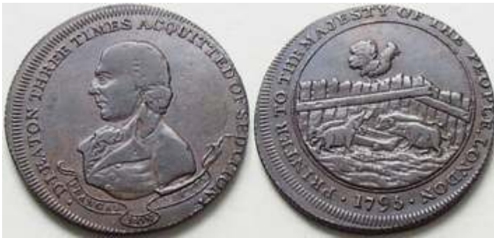
Commemorative coin stuck to celebrate Eaton's acquittal for sedition.