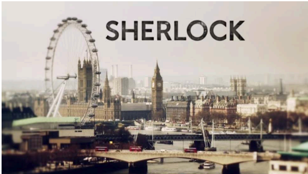
Fig. 1. Screenshot of a transitional shot in season 1 of Sherlock (2010-)