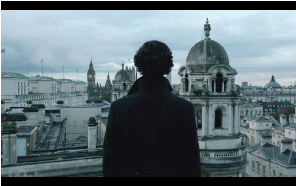
Fig. 2. Sherlock as a viewpoint, screenshot from Sherlock (2010-), season 3, episode 1 (“The Empty Hearse”)