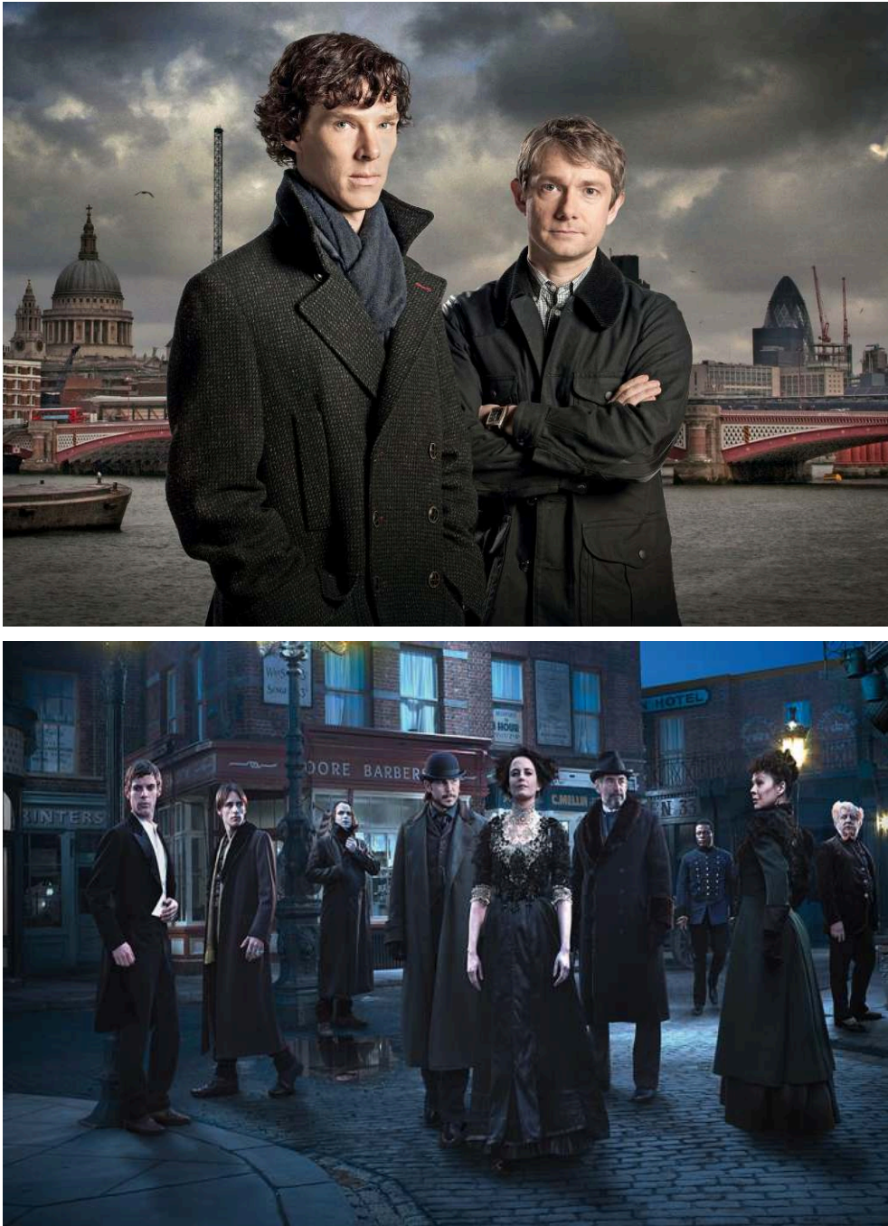
Fig. 4. Monumental London in Sherlock (season 1) vs horizontal, street-centred London in Penny Dreadful (season 1)