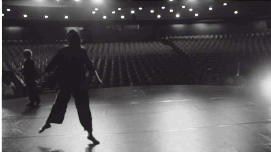
Figure 4 – The spaces of creation – inhabited network studio/stage in Black Dog (2016)