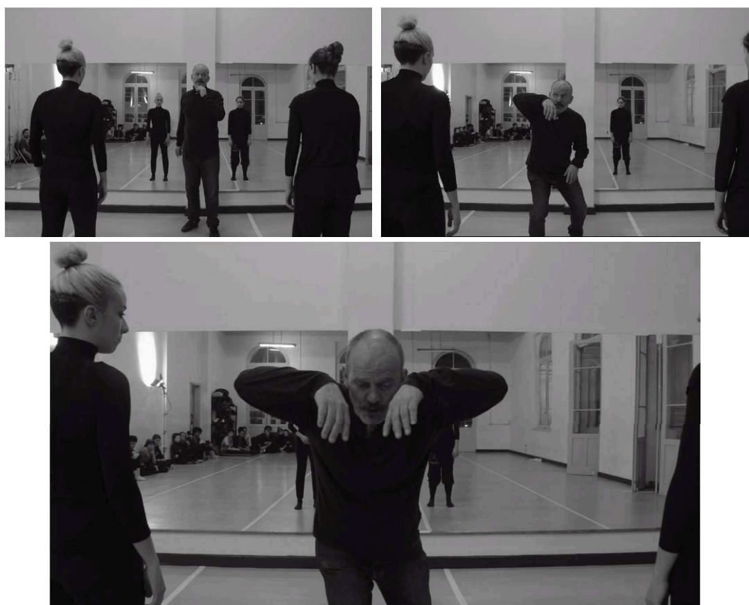
Figure 1 – Process of creating an iconic kinetic gesture for the dance piece Black Dog (2016)

other company members. Their bodies inhabit a universe close to them: the birthplace of their art, the dance studio. Their bodies celebrate a documentary voice of alterity based on characters – self-mise-en-scène – constructed in front of the camera's gaze. That doesn't stop them, however, from staging the creation of the gesture at that exact moment (Figure 1).