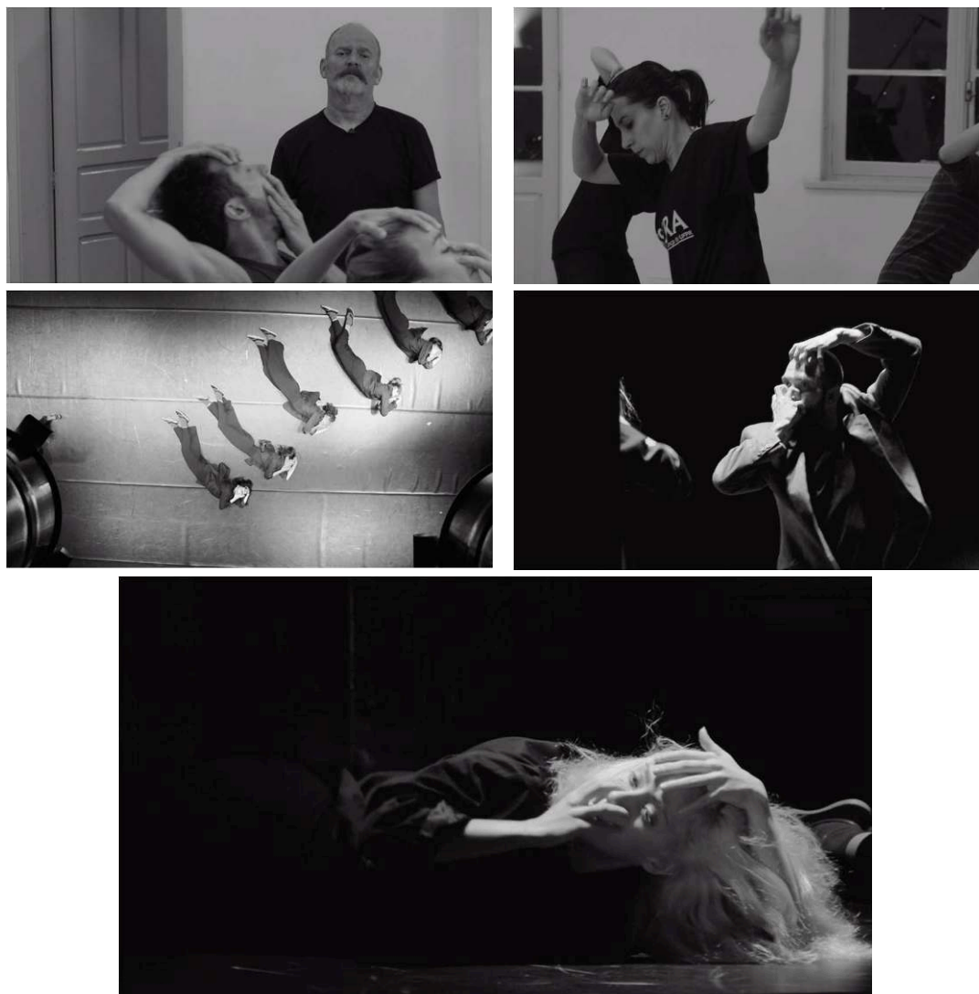
Figure 3 – Gesture appropriation in the rehearsal room and the final performance of Black Dog (2016)

During this long excerpt, we became aware that “[...] the work of art is, with rare exceptions, the result of an activity characterized by a progressive transformation, which requires, on the artist’s part, investment of time, dedication and discipline,” as noted by Salles (2000, p. 22). Because I was certain of the existence of this [trans]formative process in Black Dog , I decided to elucidate, using the documentary film, the creation process of