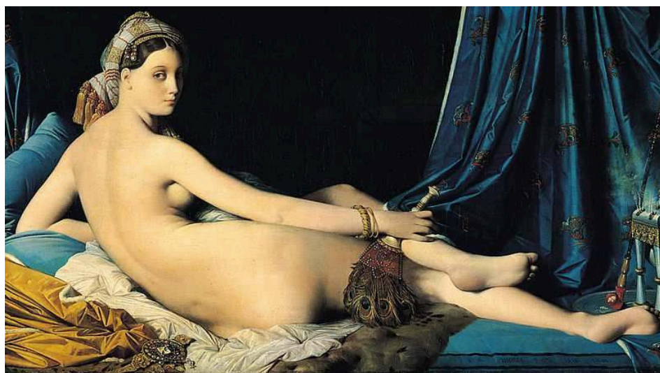
Figure 2 – Great Odalisque (1814) by Jean-Auguste-Dominique Ingres (1780–1867).

because, in colonial times, the act of covering themselves was already a female habit disseminated by Islamic doctrines. The spaces of coexistence were also generally restricted, inaccessible to men – even the Oriental ones. The painters had to then mobilise their fantasies and desires to imagine and artistically materialise the places they were not allowed to enter. This led to the figure of the odalisque as a character of Orientalist imaginary that embodies the Western expectation regarding the Oriental woman, being a frequent element in the paintings to represent Oriental women as languid, idle and available ( Great Odalisque , and Odalisque with slave by Jean Auguste Dominique Ingres, Odalisque by Renoir, Odalisque with tambourine by Henri Tanoux).