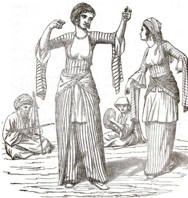
Dancing-Girls (Ghawa'zee, or Gha'zee'yehs).