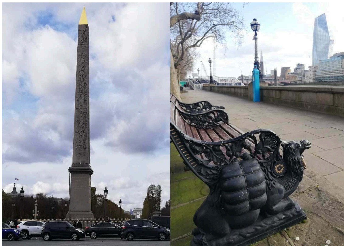
Figure 1 – On the left, the original obelisk from the Temple of Luxor (southern Egypt) in Paris and, on the right, the banks of the Victoria Embankment in London.