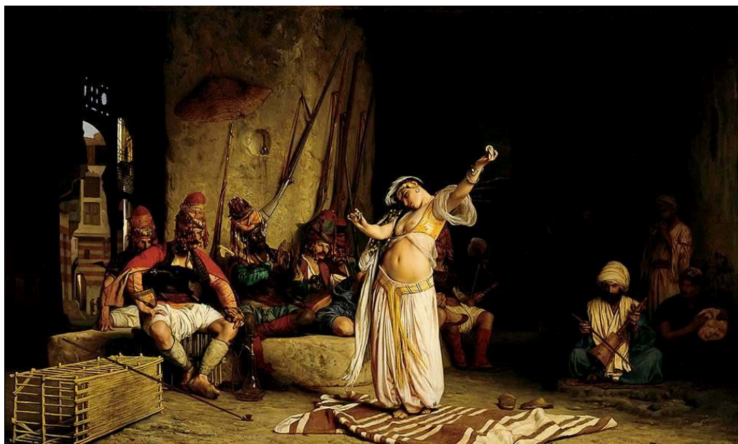
Figure 5 – La danse de l'almée (1863) by Jean-Léon Gérôme (1824–1904).

Even considering that the ghawazee sought to attract the attention of and fascinate the European audience, something that would yield them greater financial return, their representations in pictures, in most cases, exaggerated the erotic aspect of the dance. The female dancers were represented more imaginatively than realistically, especially when the images referred to the internal scenes of the harem or to the awálim . Since we know that foreign men were forbidden from entering the harems and that the awálim from the beginning of the nineteenth century did not perform in front of men, the paintings representing them can be taken as the result of male colonial creation. This is the case of Dance of the Almeh , by French painter Jean-Léon Gérôme, one of the greatest known Orientalists in the visual arts (Figure 5).