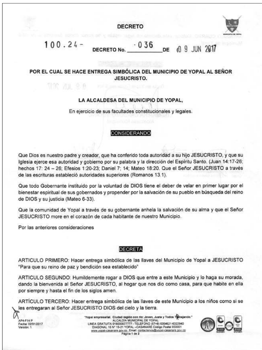
Image1. Decree No. 036 to consecrate the municipality of Yopal to Jesus Christ