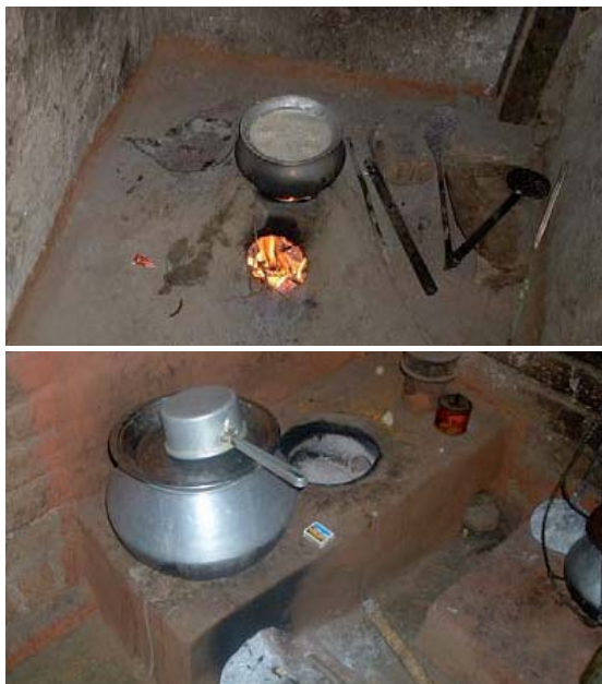
FIGURE 2: Cooking Stoves in India. Above: Traditional Cooking Stove - Below: Improved Cooking Stove

literature has been focused on trying to understand the magnitude of the exposure levels. The next main challenge, then, is to translate these exposure levels to health impacts. Therefore, we now turn to a discussion of the current state of the literature regarding the effects of air pollution on health.