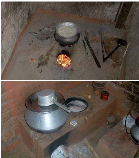
FIGURE 2: Cooking Stoves in India. Above: Traditional Cooking Stove - Below: Improved Cooking Stove

literature has been focused on trying to understand the magnitude of the exposure levels. The next main challenge, then, is to translate these exposure levels to health impacts. Therefore, we now turn to a discussion of the current state of the literature regarding the effects of air pollution on health.