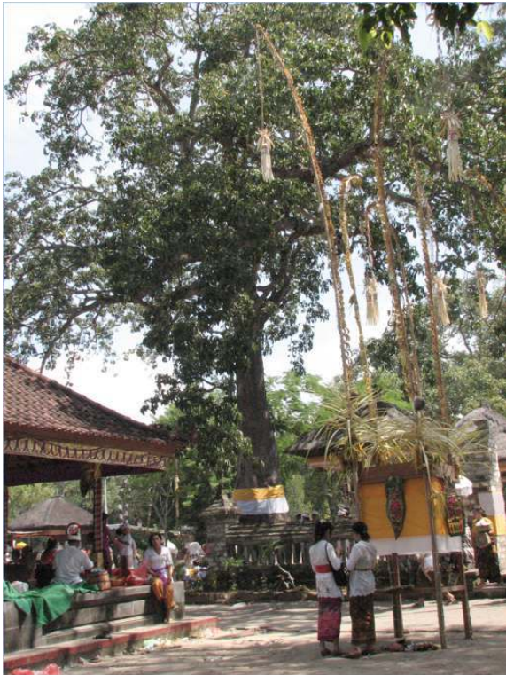
Illustration 5. The quest for “harmony” with nature

The quest for “harmony” with nature in ceremonies is shown by: dressing sacred trees, setting up Penjors made from high bamboos decorated with flowers, fruit and roots, and offerings of fruit and flowers.