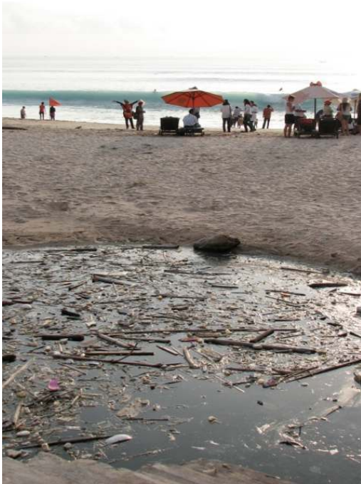
Illustration 6. Dreamland Beach

THE ENTRANCE TO DREAMLAND BEACH DESTROYS THE IMAGE OF “DREAMLAND” FOR WESTERN TOURISTS BY THE SIGHT OF STAGNANT WATER WHICH IS OFTEN HIGHLY POLLUTED. IT DOES NOT PARTICULARLY SEEM TO WORRY THE DOMESTIC TOURISTS, WHO ARE ENJOYING THE BEACH IN THE BACKGROUND.