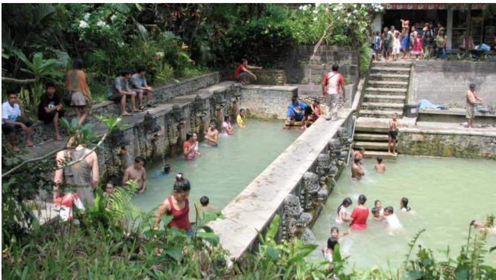
Illustration 4. Balinese enjoying hot springs for leisure but also spiritual values in Air Panas Banjar