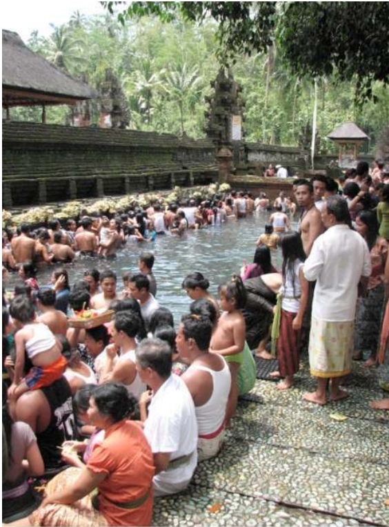
Illustration 3. Purification ritual ceremony for the Full Moon celebration, at Pura Tampak Siring