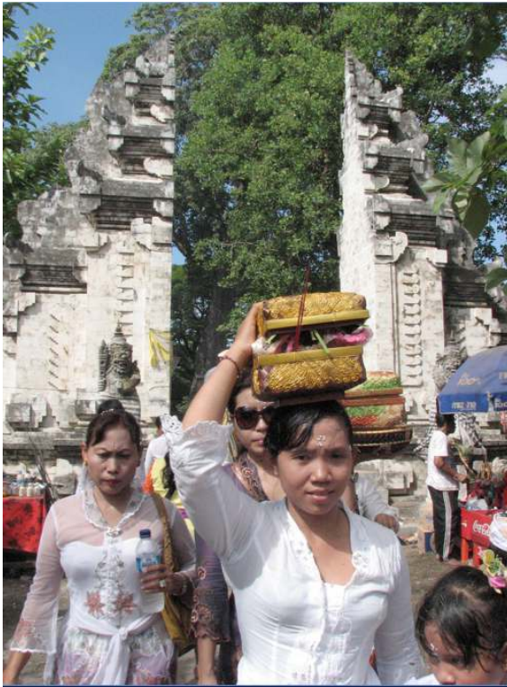
A BALINESE WOMAN CARRYING FLOWERS AND FRUIT OFFERINGS, WITH RICE STUCK TO HER FOREHEAD AS A SIGN OF PURIFICATION.