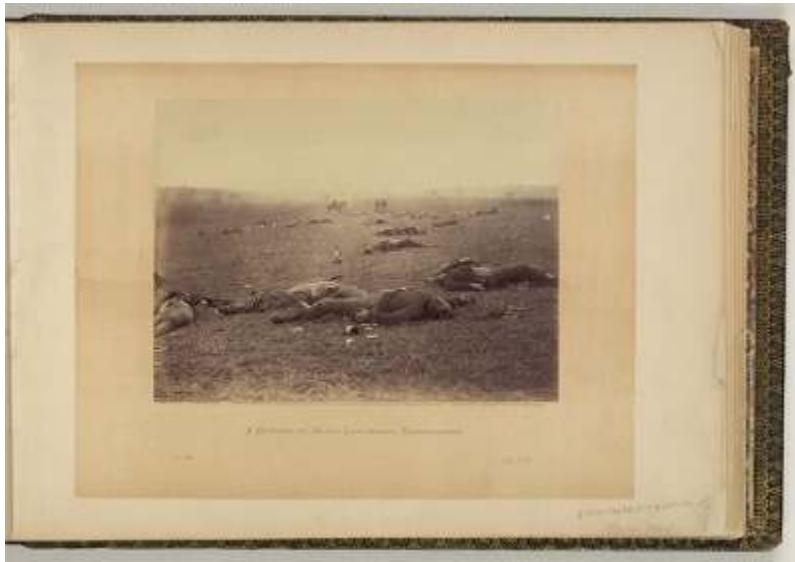
Timothy H. O'Sullivan (American, born Ireland, 1840-1882) and Alexander Gardner (American, born Scotland, 1821-1882), A Harvest of Death, Gettysburg, Pennsylvania / negative by T.H. O'Sullivan; positive by A. Gardner. Illus. in: Gardner's photographic sketch book of the war / Alexander Gardner. Washington, D.C.: Philp & Solomons, [c1866], v. 1, no. 36.