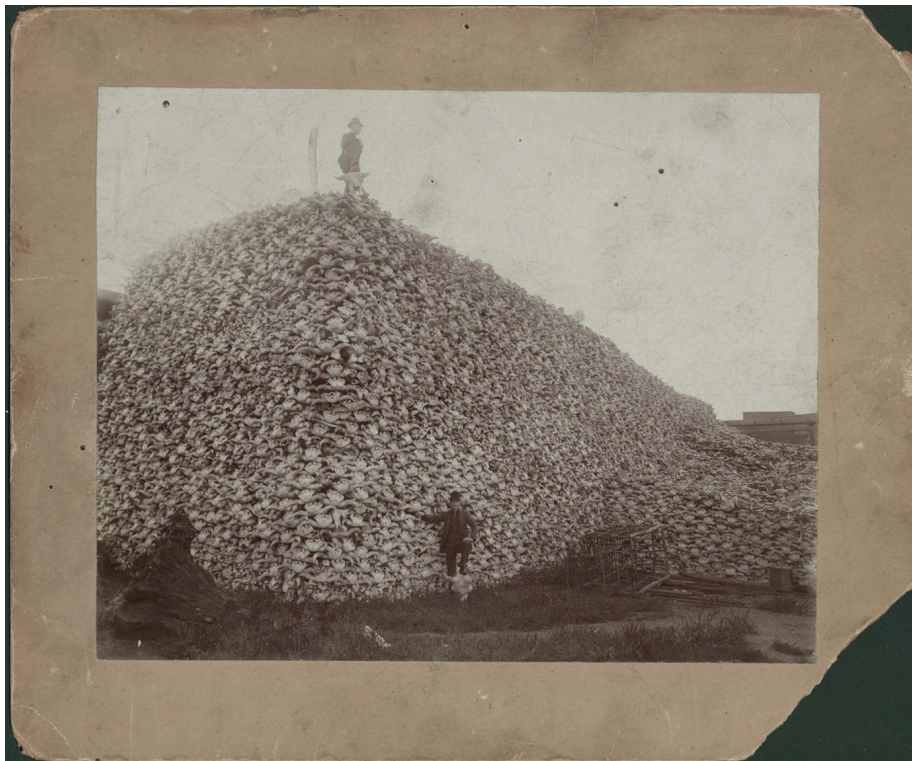
Unidentified photographer, Men Standing with Pile of Buffalo Skulls, Michigan Carbon Works, 1892. Photographic print mounted on mat board.