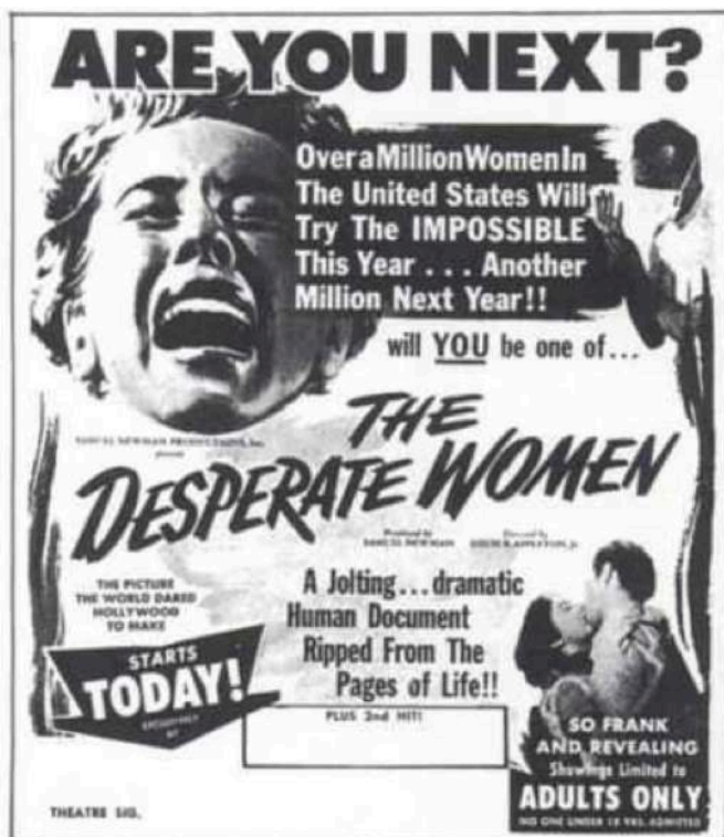
Advertisement from press book for The Desperate Women (1954) Public domain