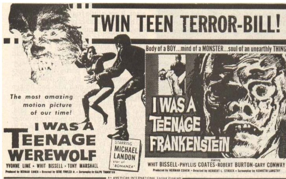
Advertisement for I Was a Teenage Werewolf and I Was a Teenage Frankenstein (1957)