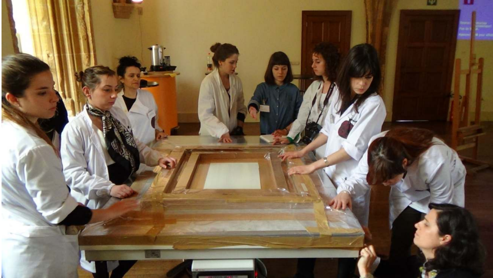
Fig. 5 Beva lining methods

Sealing of the system on the low-pressure table