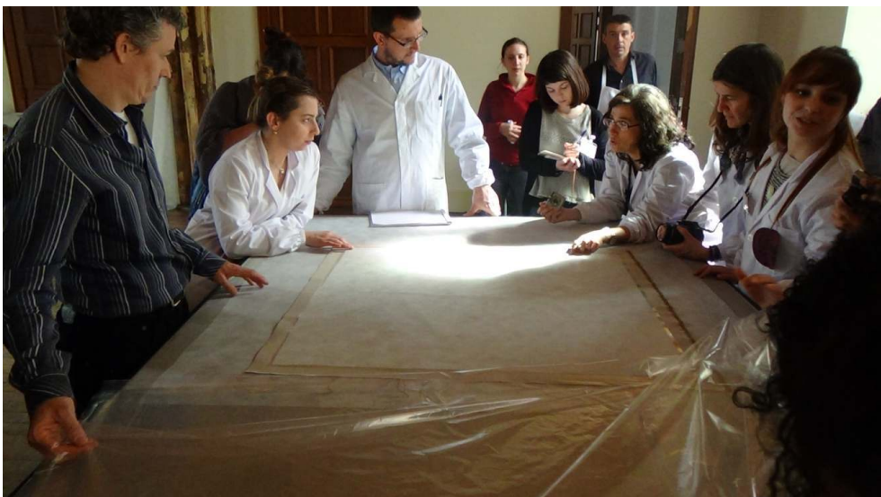
Fig. 6 Discussion on the Beva film lining with interleaf

Active reflection during the ongoing process