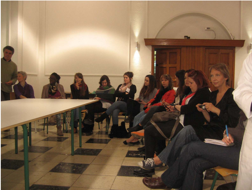
Gathering for discussion and reflection Authors' credits