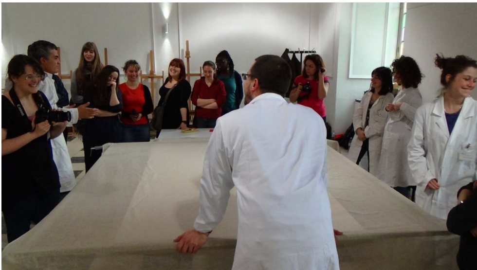
Preparation of the lining canvas Authors' credits