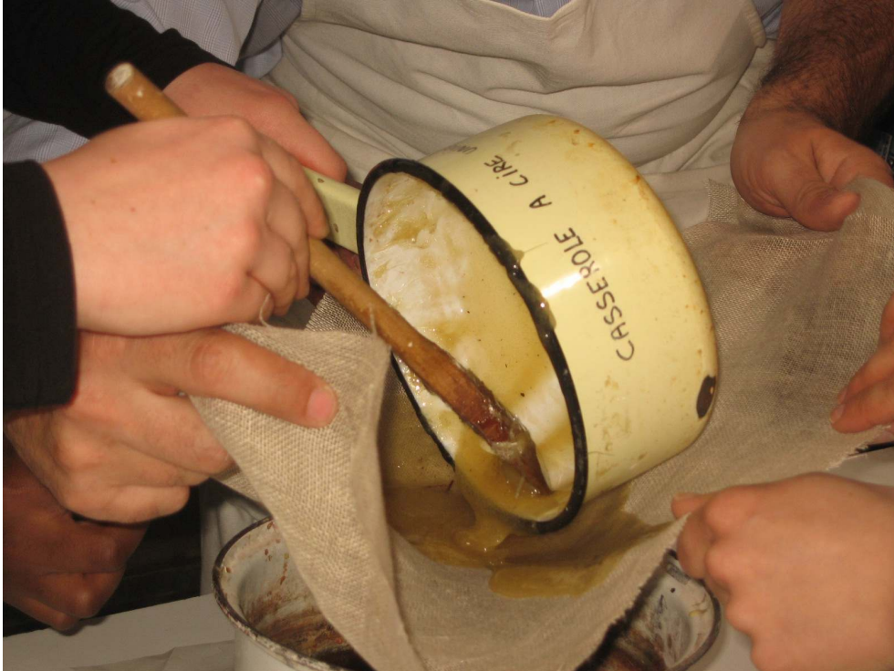
Preparation of the traditional wax-resin lining adhesive Authors' credits