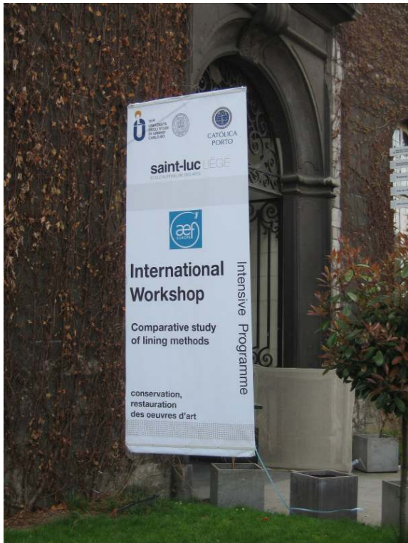
Fig. 1 Advertisement of the Workshop at the entrance of the École Supérieure des Arts Saint-Luc