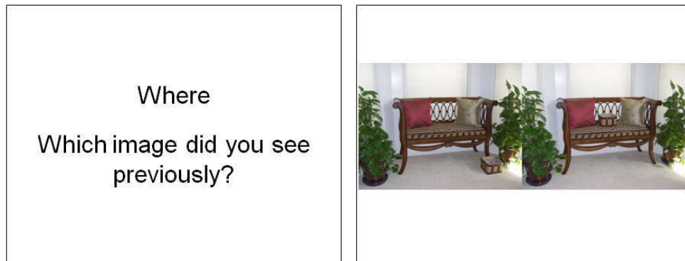
Figure 3. Example of the Where condition testing spatial memory.

Participants were asked "Which image did you see previously?" and then given 5 trials. The Where trials consisted of choosing between a previously viewed image and a scene where one object was moved to a different spatial location.