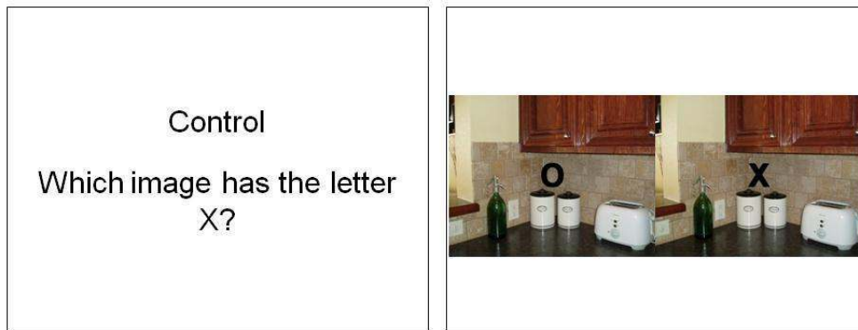
Figure 6. Example of the Control condition testing visual search.

Participants were asked "Which image has the letter X?" and then given 5 trials. The Control trials consisted of choosing between a previously viewed scene with the letter X or O overlaid on top of it.