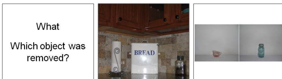
Figure 2. Example of the What condition testing object memory.

Participants were asked "Which object was removed?" and then given 5 trials. The What trials consisted of viewing a previously viewed image with one object removed for 4 s, followed by a choice between two previously seen plausible objects.